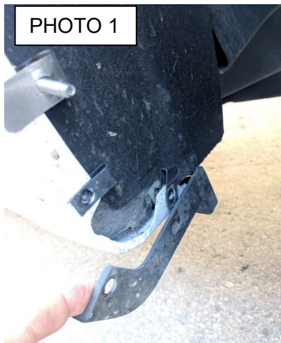
WITHOUT FENDER FLARE