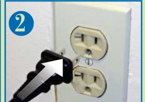
AC Power Receptacle

Connect the AC power cord to the back of the Z-Base 580. Leave the Power Switch in “Off”. Then insert the AC plug into an AC power receptacle.