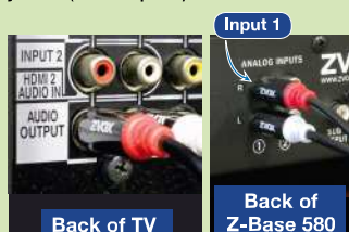
Back of TV

White/red pair of phono output jacks (not “input”) on back of TV.