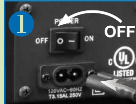
Back of Z-Base 580