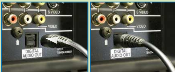
Back of TV