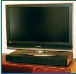
“TV base” position