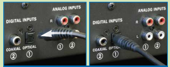
Back of Z-Base 580