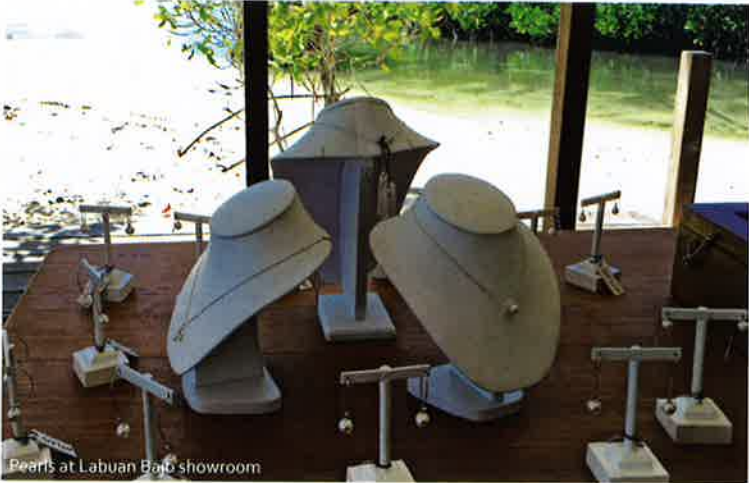
Pearls at Labuan Bajo showroom