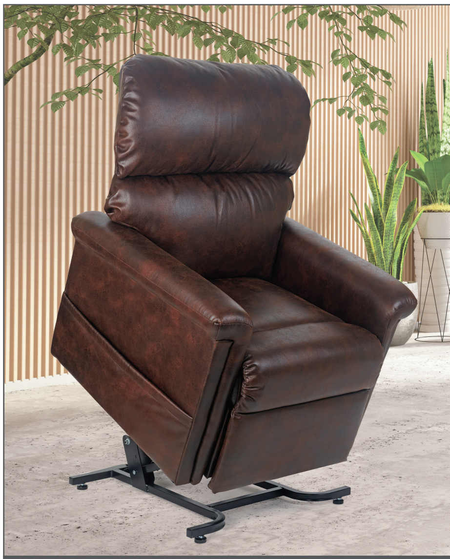
shown in Maple