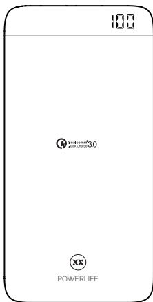
MIXX Powerlife C10 or C15 Power Bank