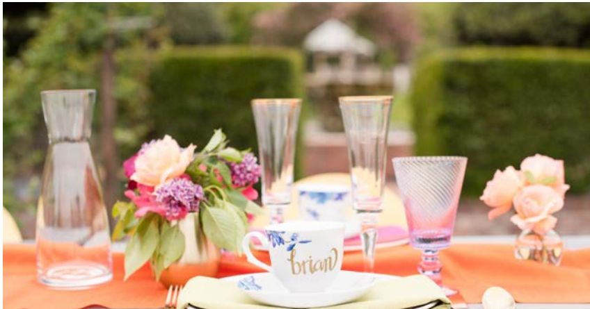
Clockwise from top left: KMR Photography, Holly D Photography, Molly Hansen Photography, Amanda Callaway Photography,