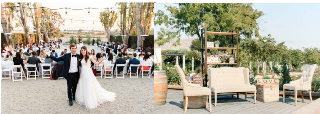
Counterclockwise: Scott and Dana Photographers, Vivian Chen Photography