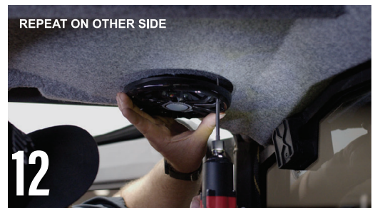
12 REPEAT ON OTHER SIDE MOUNT THE SPEAKER AND SECURE IT WITH THE INCLUDED SCREWS