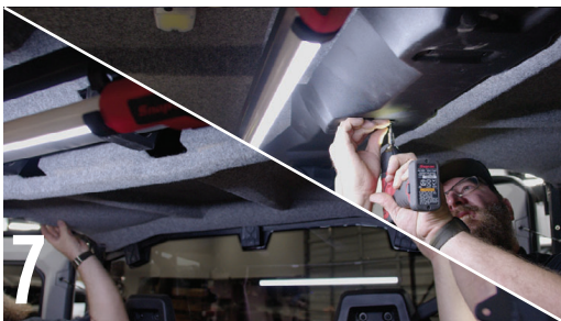
7 REATTACH THE ROOF LINER AND PLASTIC PANEL