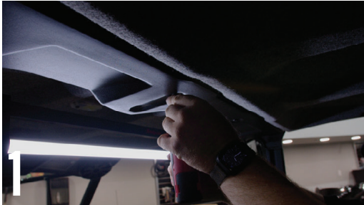
1 REMOVE THE 8 SCREWS IN THE PLASTIC ROOF PANEL THEN REMOVE PANEL