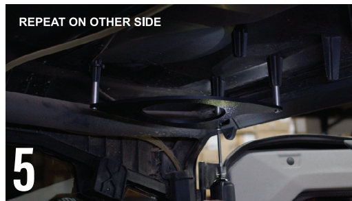
5 REPEAT ON OTHER SIDE ATTACH THE MOUNT TO THE PLASTIC PILLARS ON THE ROOF