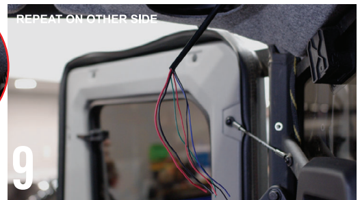
9 REPEAT ON OTHER SIDE PULL THE SPEAKER WIRE THROUGH THE NEW HOLE AND STRIP THE SHEATH TO EXPOSE THE RGB AND POWER WIRE