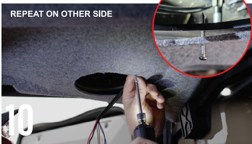
10 REPEAT ON OTHER SIDE YOU CAN PLACE A SCREW INTO THE MOUNT TO MARK THE LOCATION OF THE HOLE