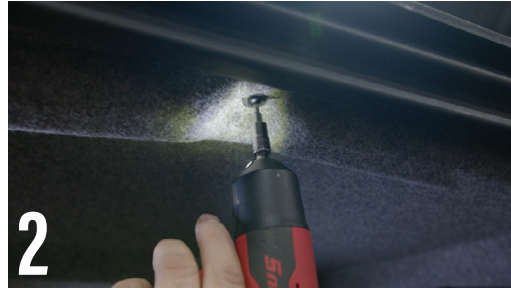
2 REMOVE THE 6 SCREWS IN THE ROOF LINER