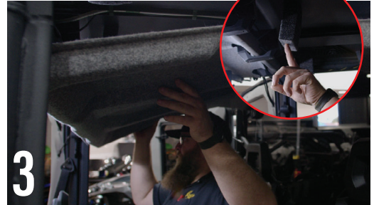
3 REMOVE THE ROOF LINER *DO NOT LOSE THE FOAM PIECES. YOU CAN REATTACH THEM IF NEEDED