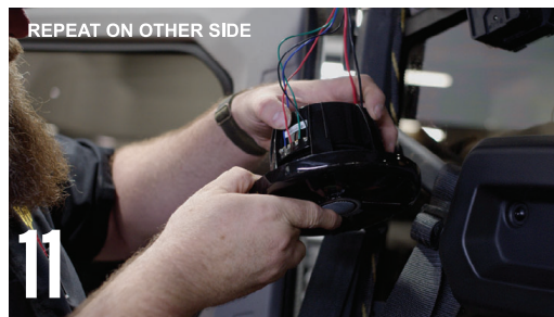
11 REPEAT ON OTHER SIDE MAKE ALL YOUR CONNECTIONS TO THE SPEAKER (RGB & POWER)