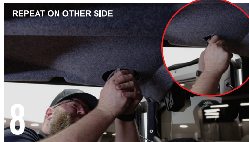
8 REPEAT ON OTHER SIDE CAREFULLY CUT OUT THE HOLE FOR THE SPEAKER *CUT A SMALL NOTCH SO YOU CAN SEE WHERE TO CUT USING THE MOUNT AS A GUIDE