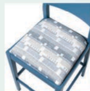
Luxury Loom Weave Blue