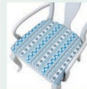
Andean Vertical Stripe Blue