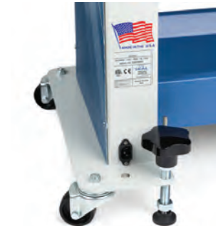
Heavy duty rear stabilizing feet.

Neschen Americas 7091 Troy Hill Drive Elkridge, MD 21075 U.S.A. Tel: 800-257-7325 Local: 410-540-8900 Fax: 800-966-4554