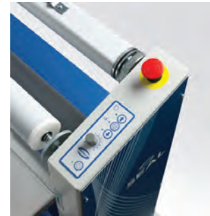
Ergonomic control panel for ease of use.