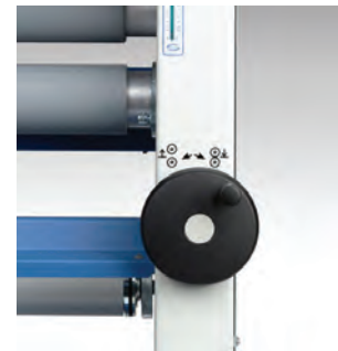
Manual nip adjustment with height gauge for precise operation.