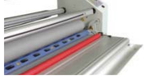
Easy Feed Table (Option for all models)