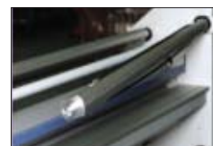
Cantilevered Supply Shaft