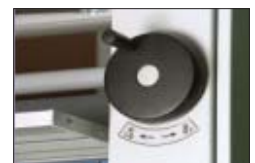
Manual Nip Adjustment