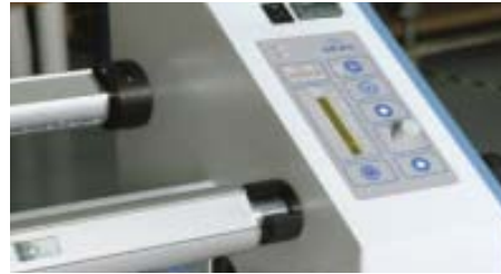
Ergonomic Control Panel (62 Pro S & C)