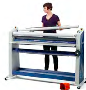
Light-weight auto grip shafts for user friendly webbing.

Neschen Americas 7091 Troy Hill Drive Elkridge, MD 21075 U.S.A.