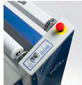
Ergonomic control panel for ease of use.

* Specifications may change without notice.