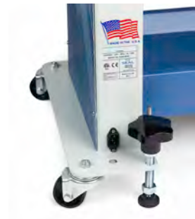
Heavy duty rear stabilizing feet.