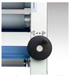
Manual nip adjustment with height guage for precise operation.