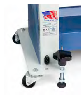
Heavy duty rear stabilizing feet.