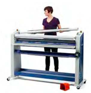
Light-weight auto grip shafts for user friendly webbing.

Neschen Americas 7091 Troy Hill Drive Elkridge, MD 21075 U.S.A.