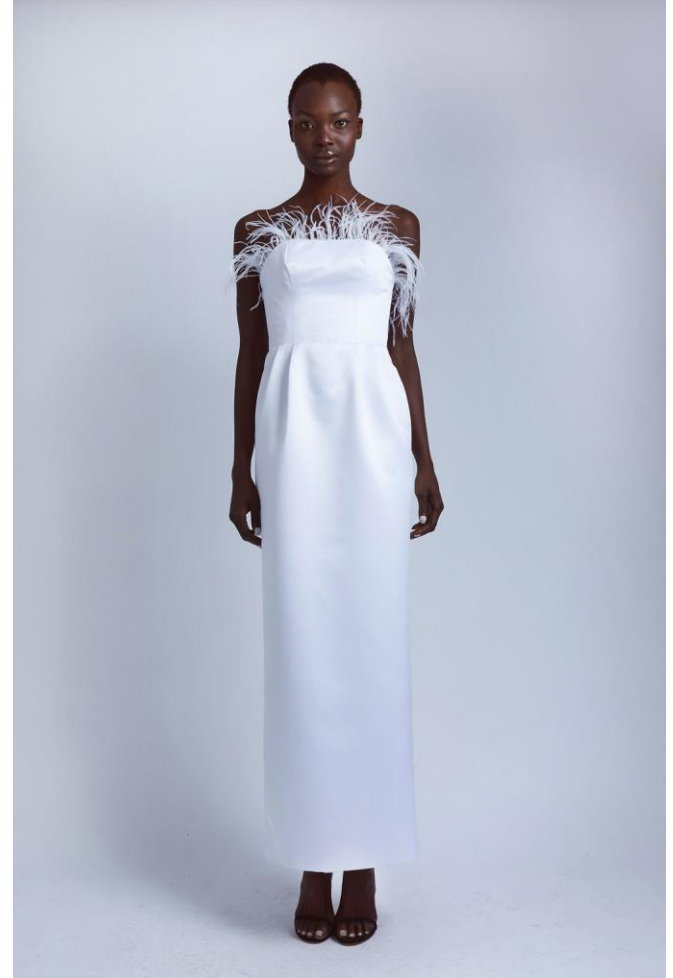
PEACE OSTRICH GOWN