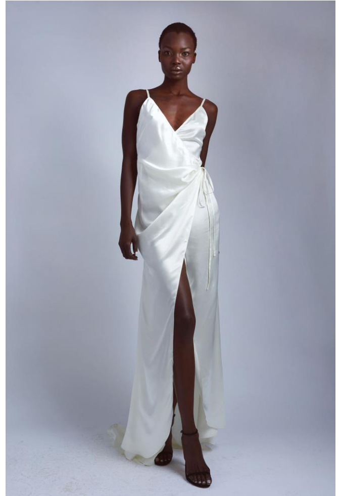
PEARLY SILKY WRAP