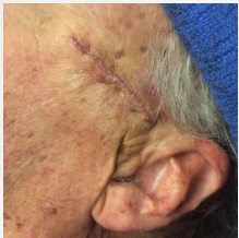
CLOSURE OF LEFT CHEEK