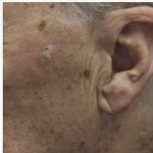
18 MONTHS LATER