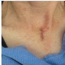
CLOSURE ON CHEST