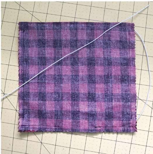
Step 3: Insert elastic cord cut to 12-13" into the corner openings while still inside out. You can use ribbon or bias tape instead, just cut it longer to allow for it to be tied in a bow.