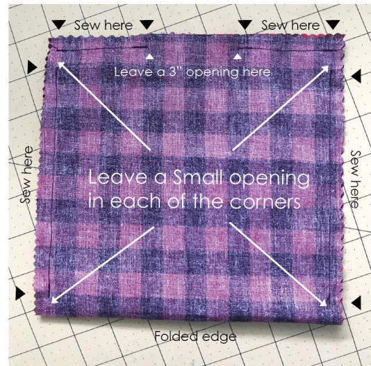
Step 2: Fold right side of fabric together and sew a line on each side, leaving spaces where indicated on the photo.