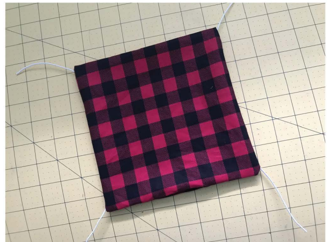
Step 4: Flip the mask right side out through the 3" opening at the bottom being careful to keep the elastic in place.