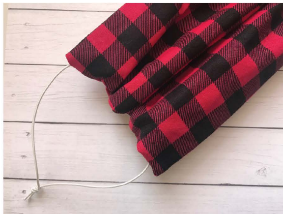
Step 5: Tie the elastic in a knot. You can untie and retie it to get the right fit. Then slide the knot into the corner hole if desired to hide it. *optional* cut a filter or blue shop towel to size and insert it into the bottom of the mask.