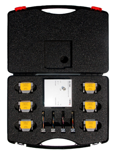
ISN T8 in storage case