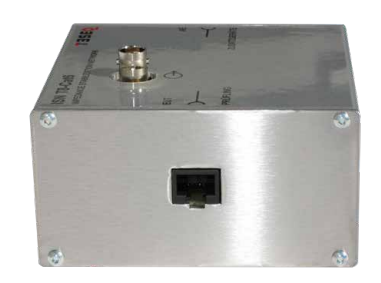
ISN T8-Cat6 with view to the EUT connection RJ45