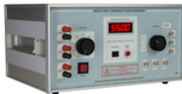
Type 9354-1 9354-2