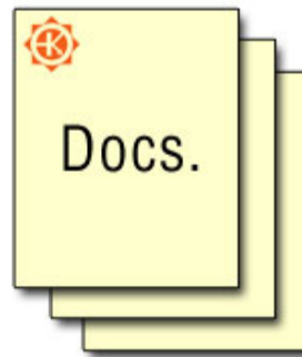
Application of products