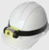
Fits On Any Hard Hat