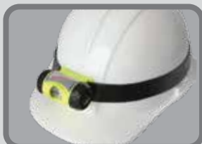
Fits On Any Hard Hat With Rubber Helmet Band Option