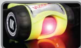
Red Diffuse Beam Aids Night Vizion