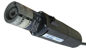
ESG Plus 2