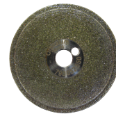
Diamond grinding wheels