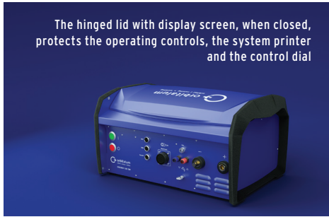
The hinged lid with display screen, when closed, protects the operating controls, the system printer and the control dial