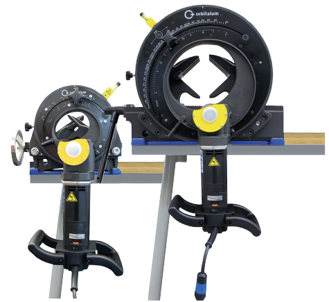
GFX 3.0, GFX 6.6

The technical data are not binding. They are not warranted characteristics and are subject to change. Please consult our general conditions of supply.