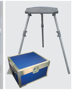
Tripod made of aluminum and high-quality padded blue shipping case for GFX 3.0 optional available