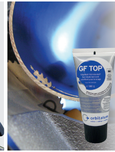
Saw blade lubricant GF TOP included