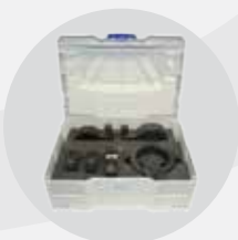
Available in Sets