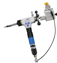
BRB 2 Pneumatic/Auto with clamping system "Standard"