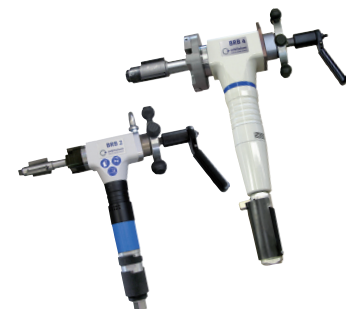
BRB 2 and BRB 4 Pneumatic with clamping system "NC"