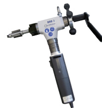
BRB 2 Electric with clamping system "NC"