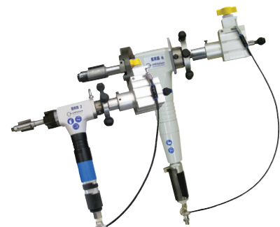
BRB 2 and BRB 4 Pneum./Auto with clamping system "NC"