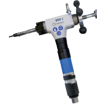
BRB 2 Pneumatic with clamping system "Standard"