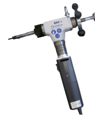
BRB 2 Electric with clamping system "Standard"

The technical data are not binding. They are not warranted characteristics and are subject to change. Please consult our general conditions of supply.