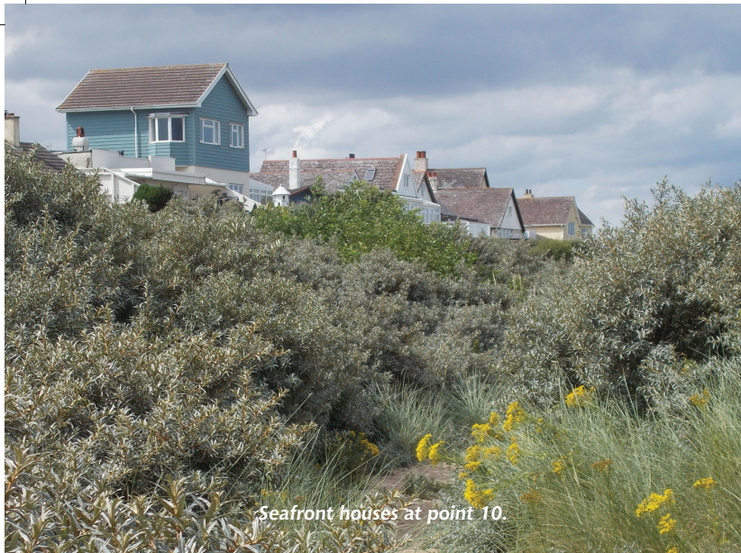
Seafront houses at point 10.