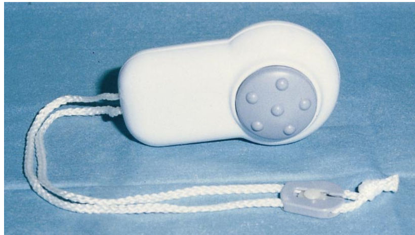
Fig. 1. The 'Queen Square bladder stimulator'.

frequency of vibration was determined to be about 60 Hz. The device is powered by two 1.5 V batteries in series that fit into a compartment in the body of the device. The head of the device vibrates when pressed against any part of the body and there is also a clearly audible buzzing when it is used.