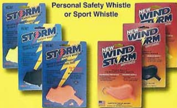
Personal Safety Whistle or Sport Whistle

The Storm and Windstorm whistles operate in any environment, wet or dry. Each whistle performs powerfully both above and below the water. Due to their patented water purging design, these all-weather whistles are ideal for activities such as diving, boating, camping, hunting, hiking or sporting events. The Storm and Windstorm whistles can be heard underwater for distances in excess of 50 feet and on the surface for over half a mile.