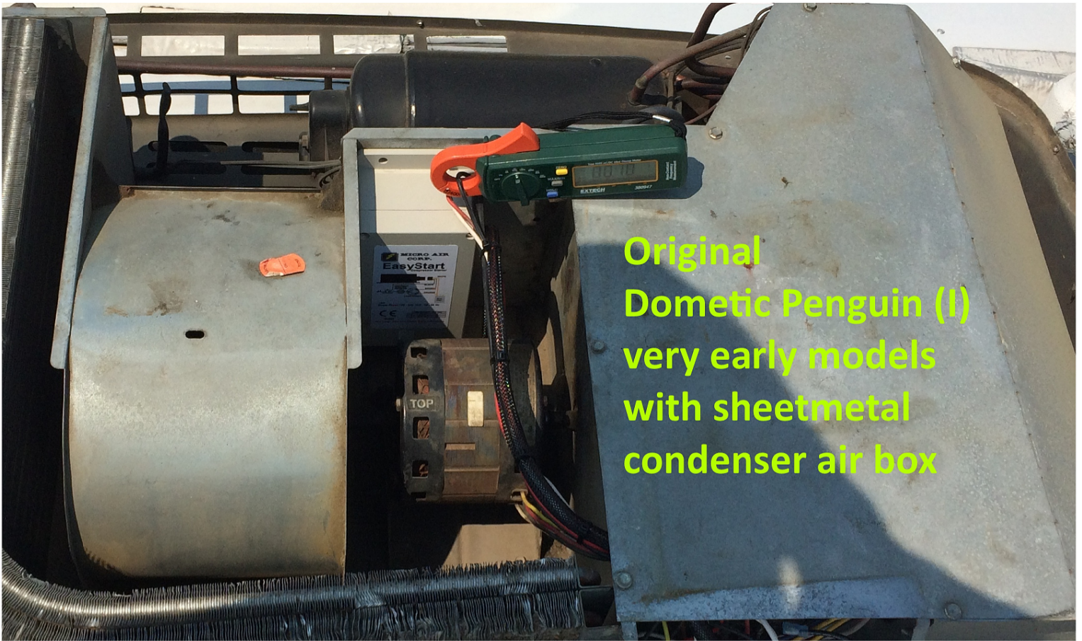
Original Dometic Penguin (I) very early models with sheetmetal condenser air box