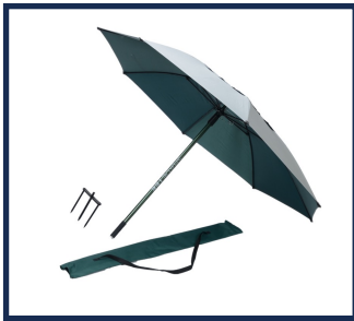
ShadeTee Umbrella, carrying case with shoulder strap and hardened steel stake