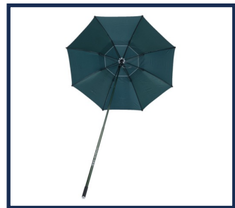
6' diameter, 50 UPF shade ensures max protection from sun's heat and harmful rays.