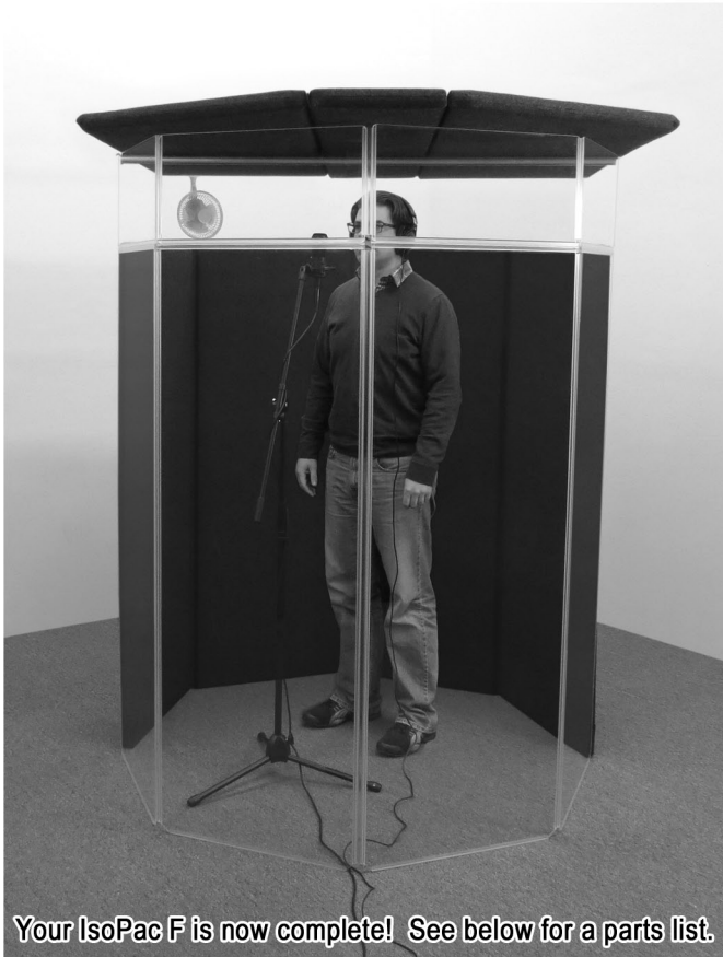
Your IsoPac F is now complete! See below for a parts list.