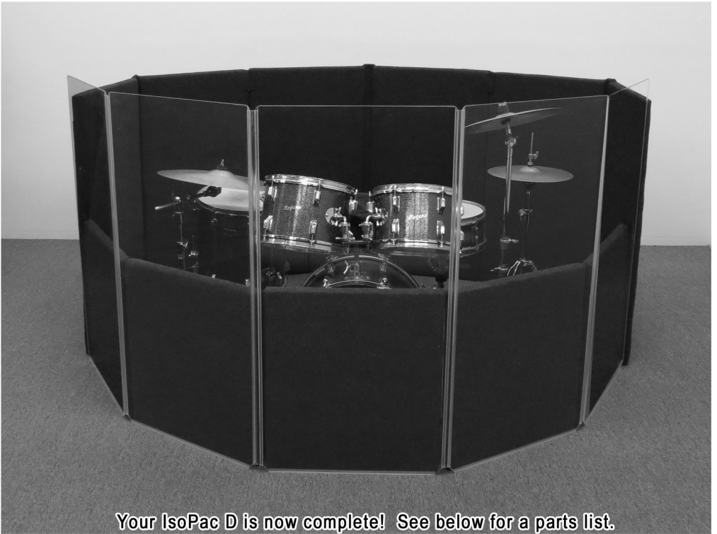
Your IsoPac D is now complete! See below for a parts list.