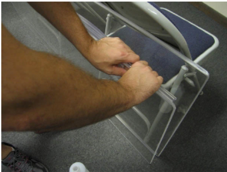
3. Snap hinge into groove on one panel by pressing straight down