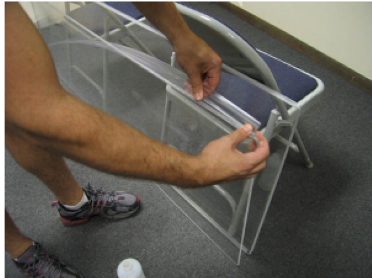
2. Line up hinge with panels