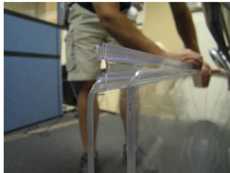
4. Continue seating hinge into groove