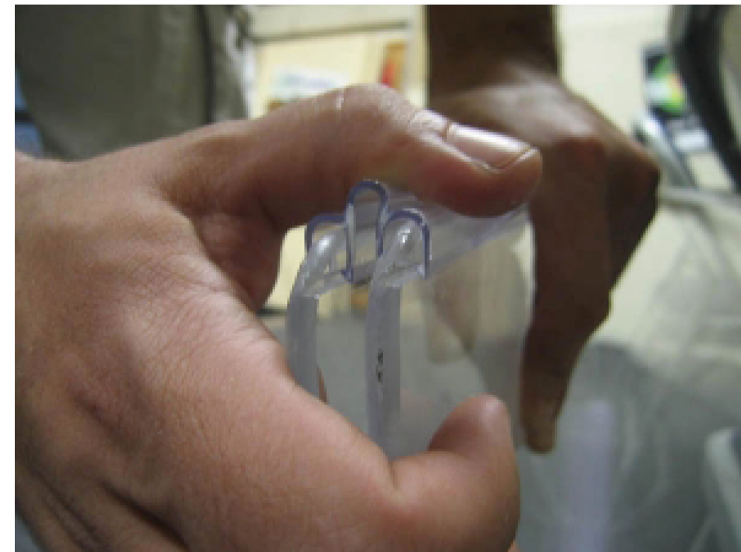
5. Bend hinge over onto adjoining panel and snap into groove. Attached completely to entire length of adjoining panel.