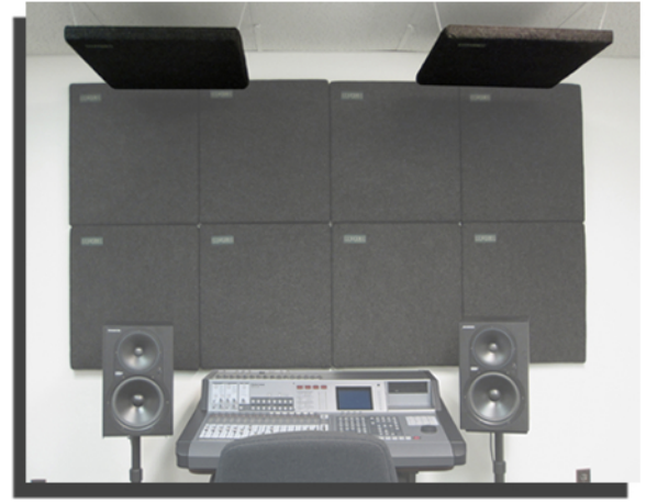
S2224 Clouds in a studio mixing area

Because of their light weight and velcro receptive qualities, many ClearSonic SORBER baffles can easily be hung from the ceiling as 'clouds'. S2224, S2233, & S2448 are the most common.