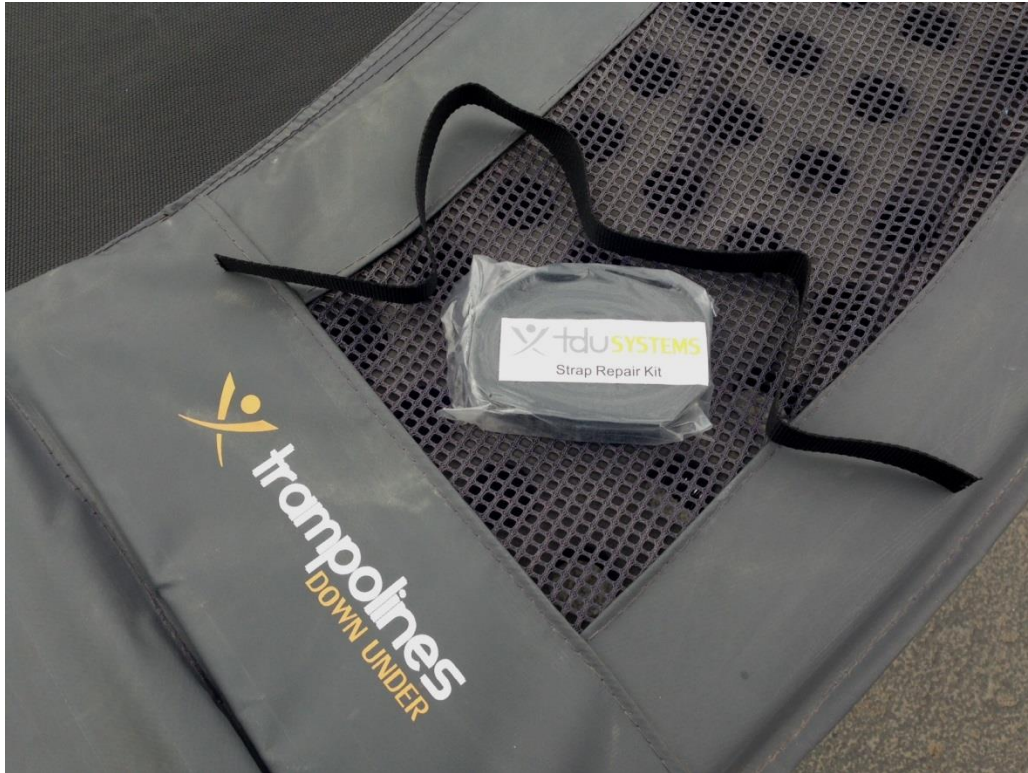
1: Remove Straps from Kit