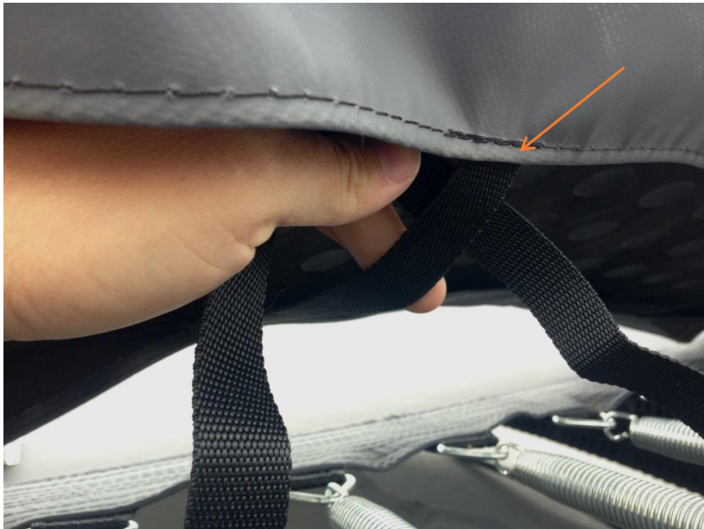
2: Loop strap through pad support strap on both sides of the section strap that was damaged.