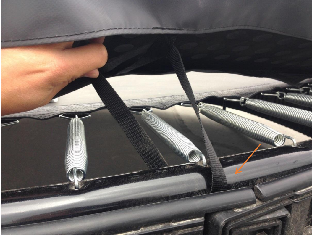
3: Loop the repair strap around frame of Trampoline