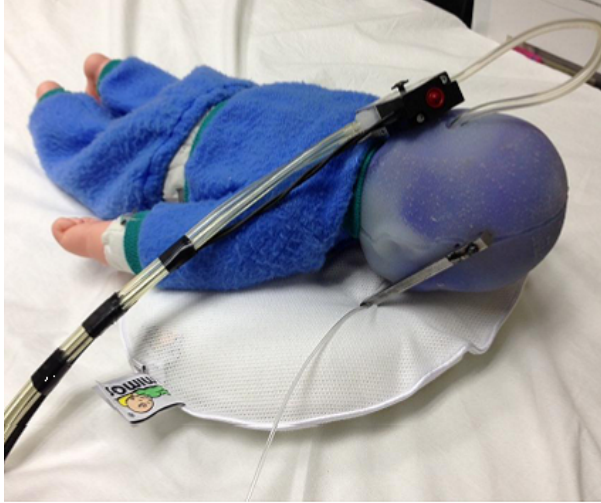
Figure 7 Assessment of Mimos Pillow with Pillow Case