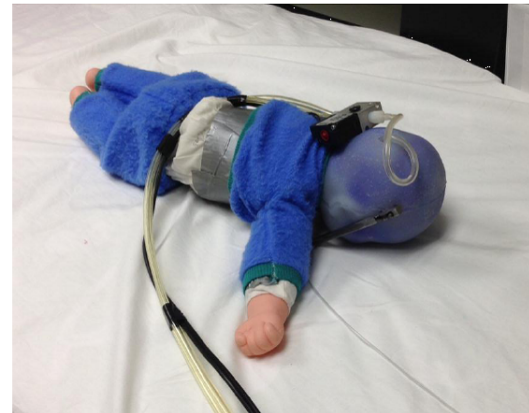
Figure 11 Firm Mattress and Cotton Sheet Carbon Dioxide Rebreathing Evaluation