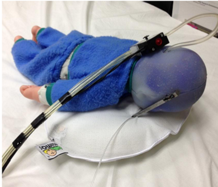
Figure 7 Assessment of Mimos Pillow with Pillow Case

To determine the location of an evaluation sight, components that possess filled or partially filled volumetric characteristics are identified. For the previous assessment WOUK05200, the Mimos pillow was evaluated at different locations to identify the most significant potential location on the pillow where the hazard may be at its highest level. For this current assessment, an assessment was completed on the same location on the pillow, as seen below in Figure 7 and Figure 8. For all experiments, the head of the mannequin was placed with its face pressed into the Mimos sample to represent the worst case scenario. To assess the Mimos pillow case, CO 2 readings in the Mimos pillow were compared with and without the pillowcase.