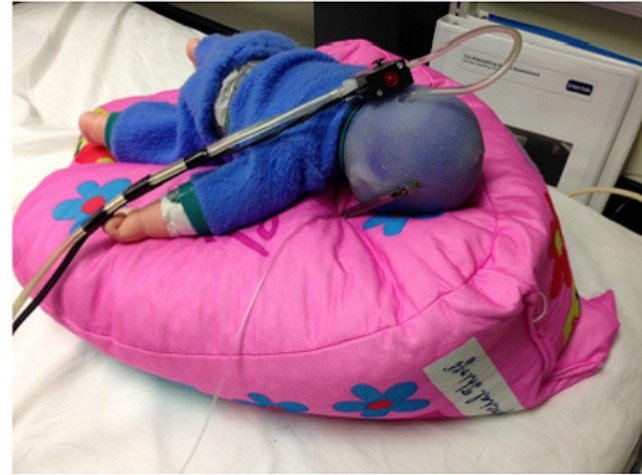
Figure 9 Bean Bag Carbon Dioxide Rebreathing Evaluation Detail

The mattress with cotton sheet is used as a reference product with a low level of hazard and can be seen in Figure 11.