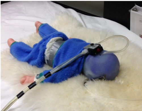
Figure 10 Long Haired Sheepskin Carbon Dioxide Rebreathing Evaluation Detail

The mattress with cotton sheet is used as a reference product with a low level of hazard and can be seen in Figure 11.