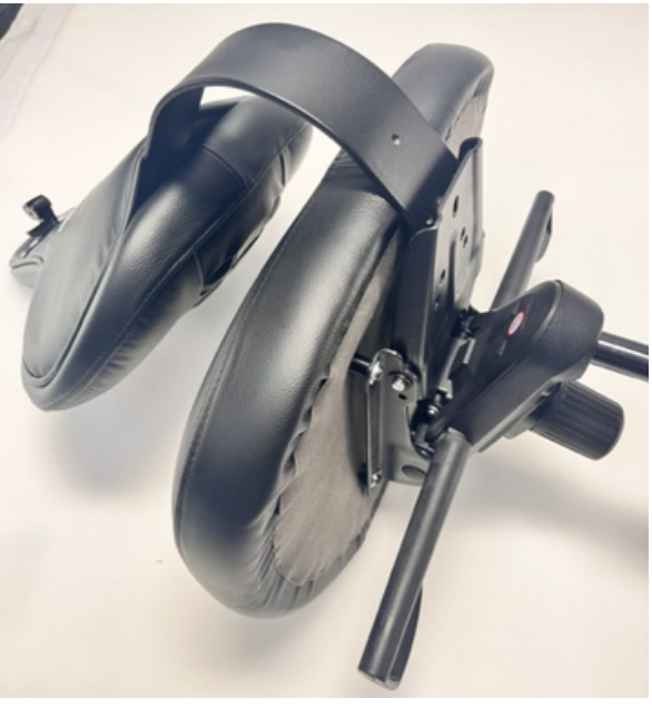
Make sure to line up the three holes found on both parts.