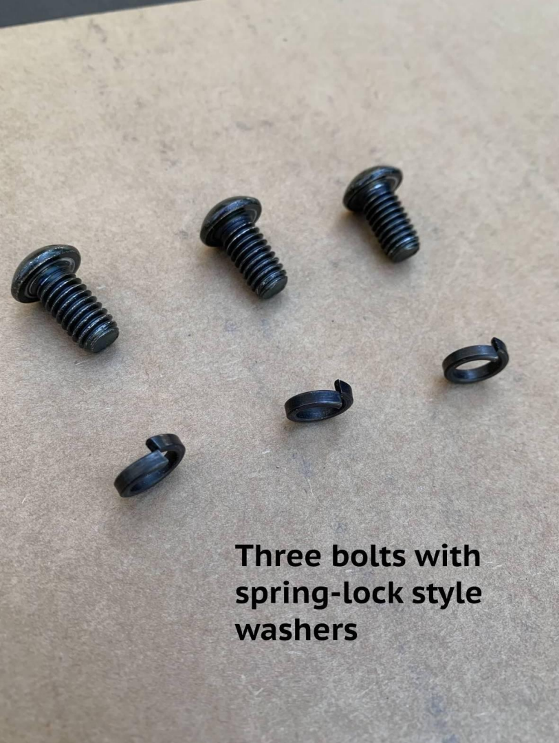
Three bolts with spring-lock style washers