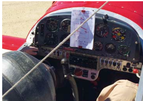
A Sequence Card ready to follow - Likened to playing a piano from sheet music.

If we had a bigger population we would probably have qualifying competitions around the country. In Oz, with both a bigger population and the various State Chapters of the Australian Aerobatic Club, they have State Championships. However, their Nationals are still a free-for-all. In fact I've just attended their 2016 Nationals at Tocumwal, north of Melbourne, as