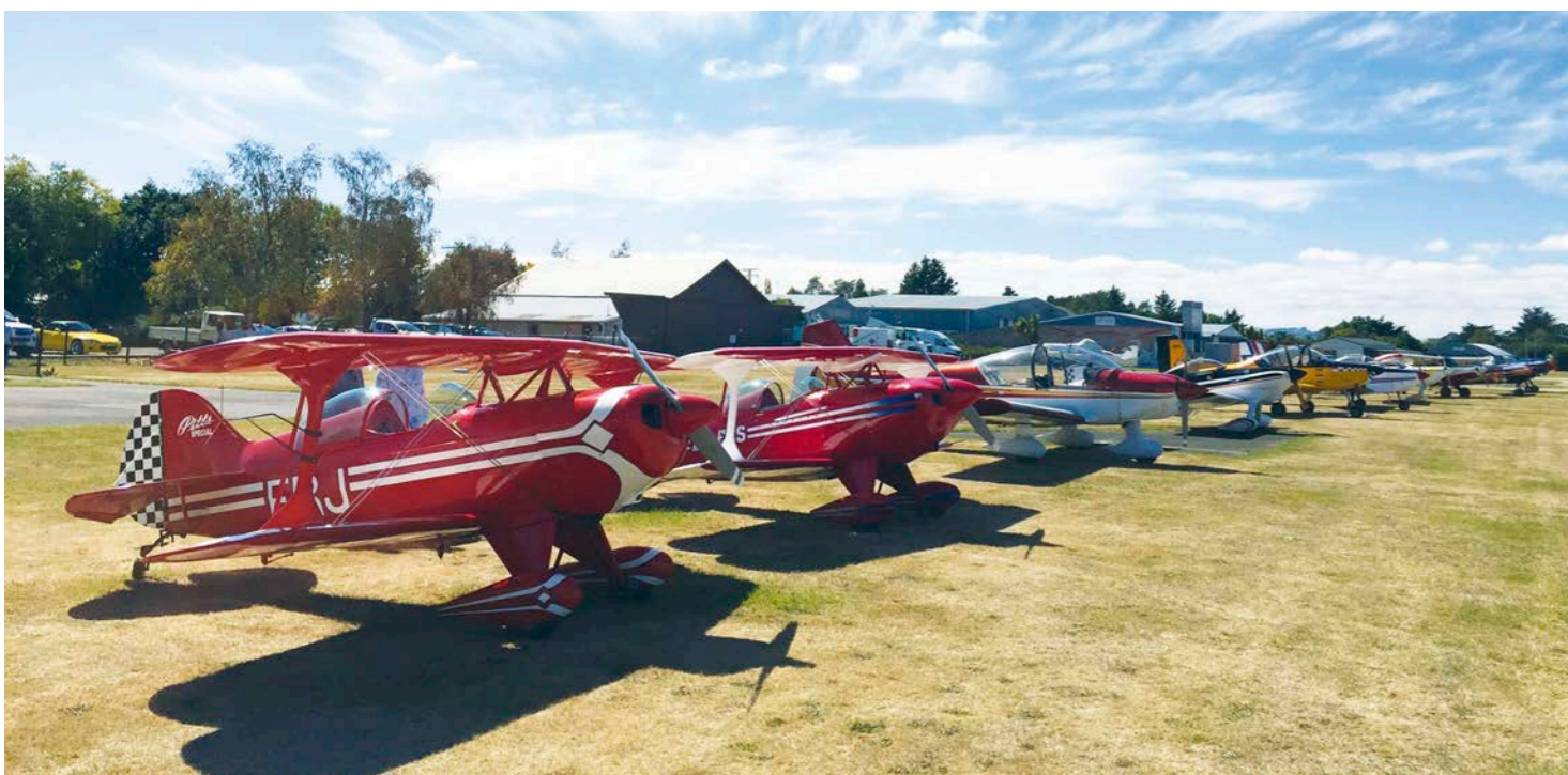
Plenty of variety in this line-up of competitors.