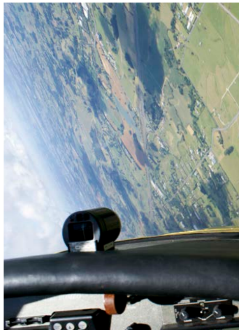
Where was it again?

taking a break, climbing for height and giving yourself time to figure what went wrong but more particularly where to start off again, in the right direction and at the right speed and height. There is no rush, and many times I have seen people take a break only to be starting in the wrong direction, or with insufficient speed and/or height. You do get a penalty for taking a break, but if you subsequently 'zero' every following manoeuvre for flying them in the wrong direction, you will really be kicking yourself. And the poker-face judges will probably just say to you, over the lunch break, "That looked like fun"!