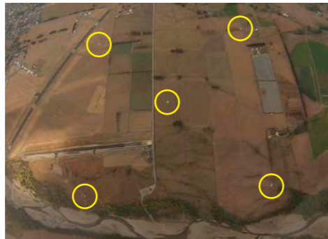
Ground markers identify the box location.

Despite all your best efforts, you may/will get lost - in the sequence or geographically. It is not the end of the world or even the end of your chances of glory. In competition aerobatics there is a saying 'He who finishes with no zeros, wins', which can be true, but conversely in some programmes we see everybody have a 'zero' score for a manoeuvre or two, which levels the playing field again. NEVER GIVE UP!. The secret is to recover 'well', which means