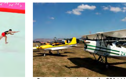
Two competing aircraft at the 2014 Nationals could they be any more different?

Competition aerobatics is often compared to horse dressage competitions or floor gymnastics. Olympic floor gymnasts' are