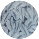
Dining room feature wall Wallpaper from LayerPlay Design

Island Frond Moonlit wallpaper design that was provided by bespoke wallpaper company Robin Sprong, chosen for the blue-base and gold accents that would complement the space's design theme. Meanwhile on the opposite wall, two customised wall shelves allow for the display of family trinkets and ornamental decor. Unable to find ready-made shelves tall enough to complement the high ceilings, Liang May had the shelves customised, which the carpenter made from plywood and finished with dark woodgrained laminates, complete with a white backing to create a seamless continuity with the rest of the wall. A giraffe canvas painting by animal artist Thierry Bisch ties the two wall features together. When it came to her son Ewan's room, Liang May's heart was set on a monochromatic