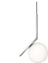
Brass pendant lamp from Meraki Decoration

Living up the space is the addition of black wall shelves that serves as a platform to display flowers and ferns. In addition to Patricia Braune's Island Frond Moonlit wallpaper design next to the corridor, three paintings by local botanical artist Sarah Lim of Poppy Flora Studio beneath the shelf further accentuates the nature theme and is complemented well by the gold-trimmed wall mirror that hangs just beside.