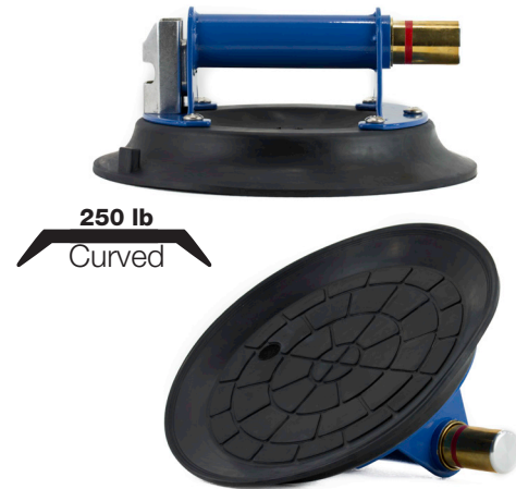
250 lb Curved