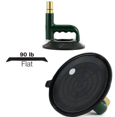
90 lb Flat

GT Tools® 10" diameter curved vacuum suction cup with metal body and gas barrel. Excellent for lifting and carrying stone tiles, slabs, and glass. Great for curved or flat surfaces. 300 lbs maximum horizontal lifting capacity and 250 lbs maximum vertical lifting capacity. All GT Tools® pump suction cups include a red line vacuum loss warning indicator.