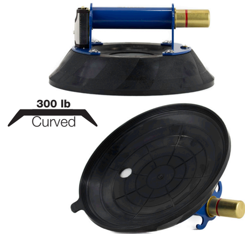
300 lb Curved