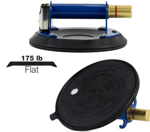
175 lb Flat