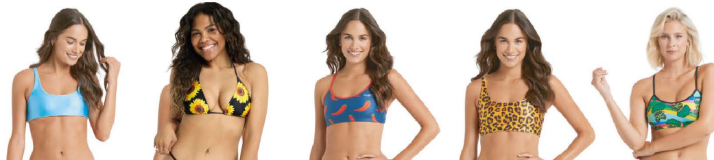
PALM BEACH (REVERSIBLE)