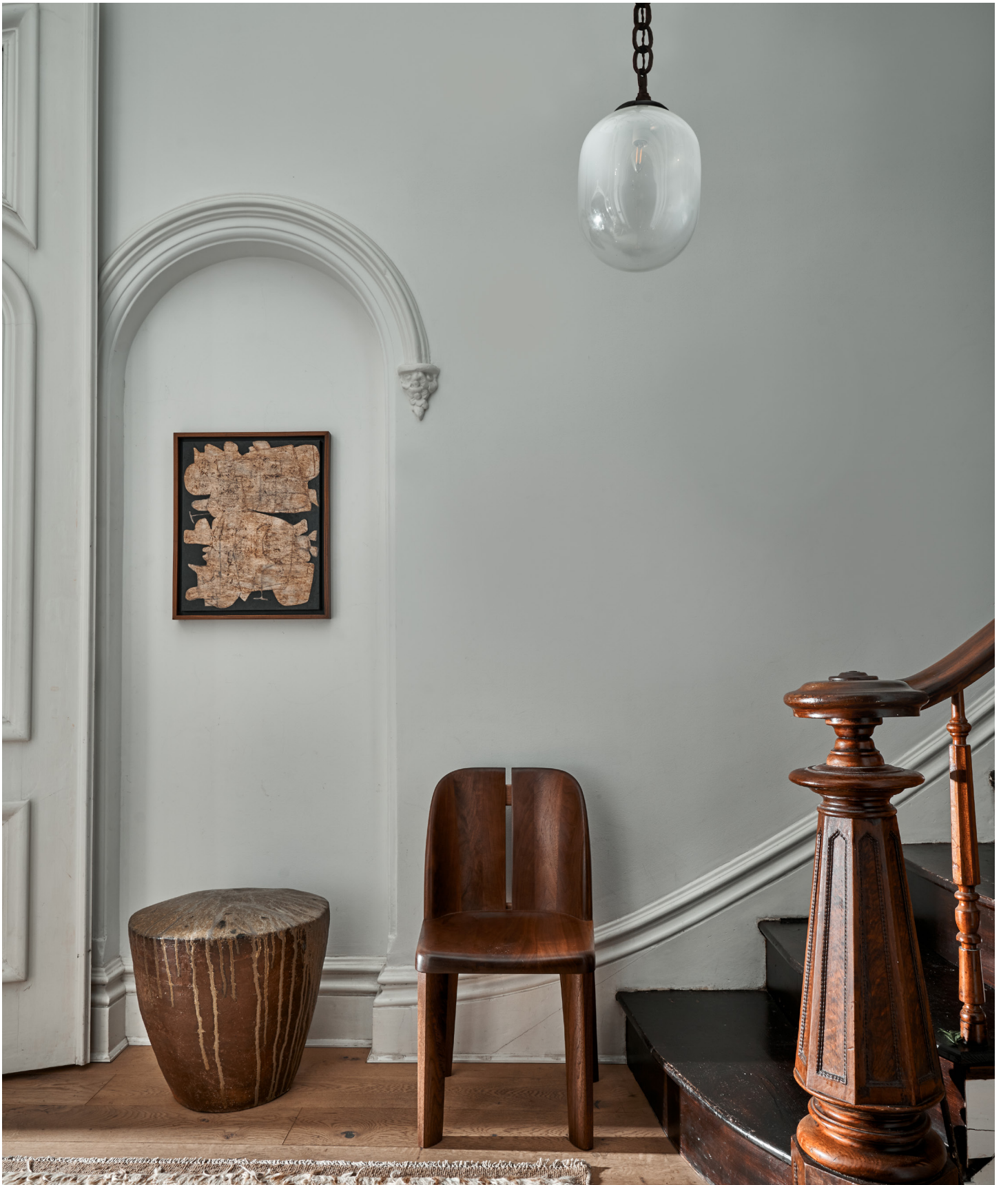
ARCHITECTURAL BROWN BRONZE FINISH, GRADIENT GLASS

FIFTY-THREE HOWARD STREET NEW YORK, NY 10013