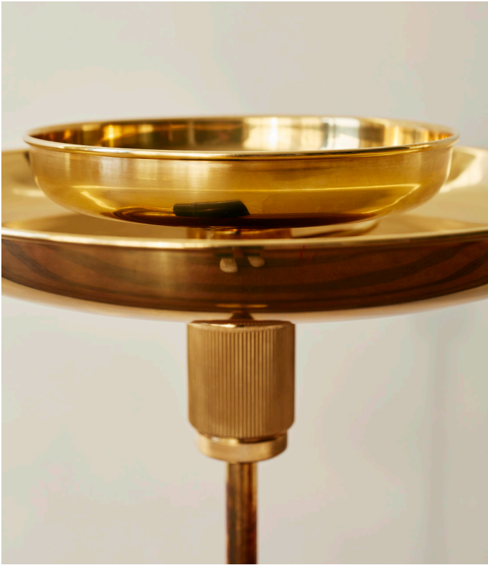
BURNISHED BRASS WITH METAL SHADE