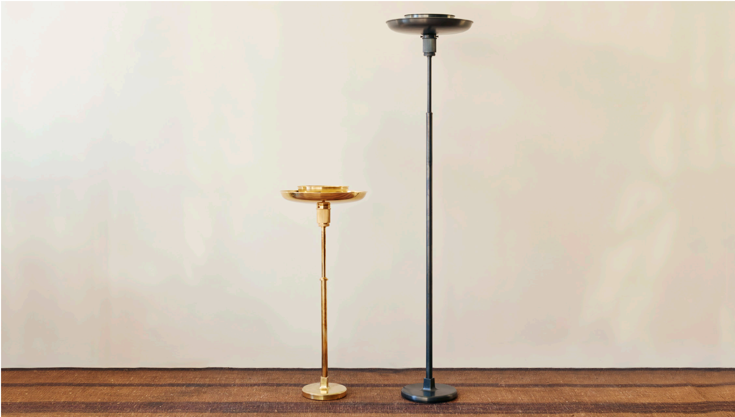
(LEFT) BURNISHED BRASS WITH METAL SHADE, (RIGHT) OSCAR TORCHIERE FLOOR LAMP IN BLACKENED BRASS WITH METAL SHADE