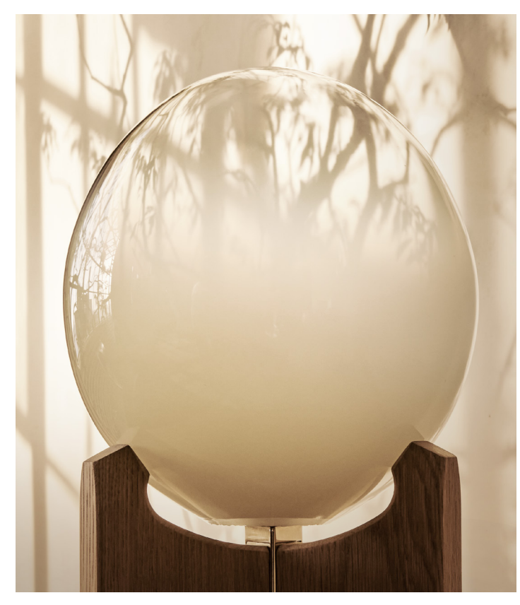
BURNISHED BRASS, OLD GROWTH WHITE OAKED SOAPED, GRADIENT GLASS SHADE