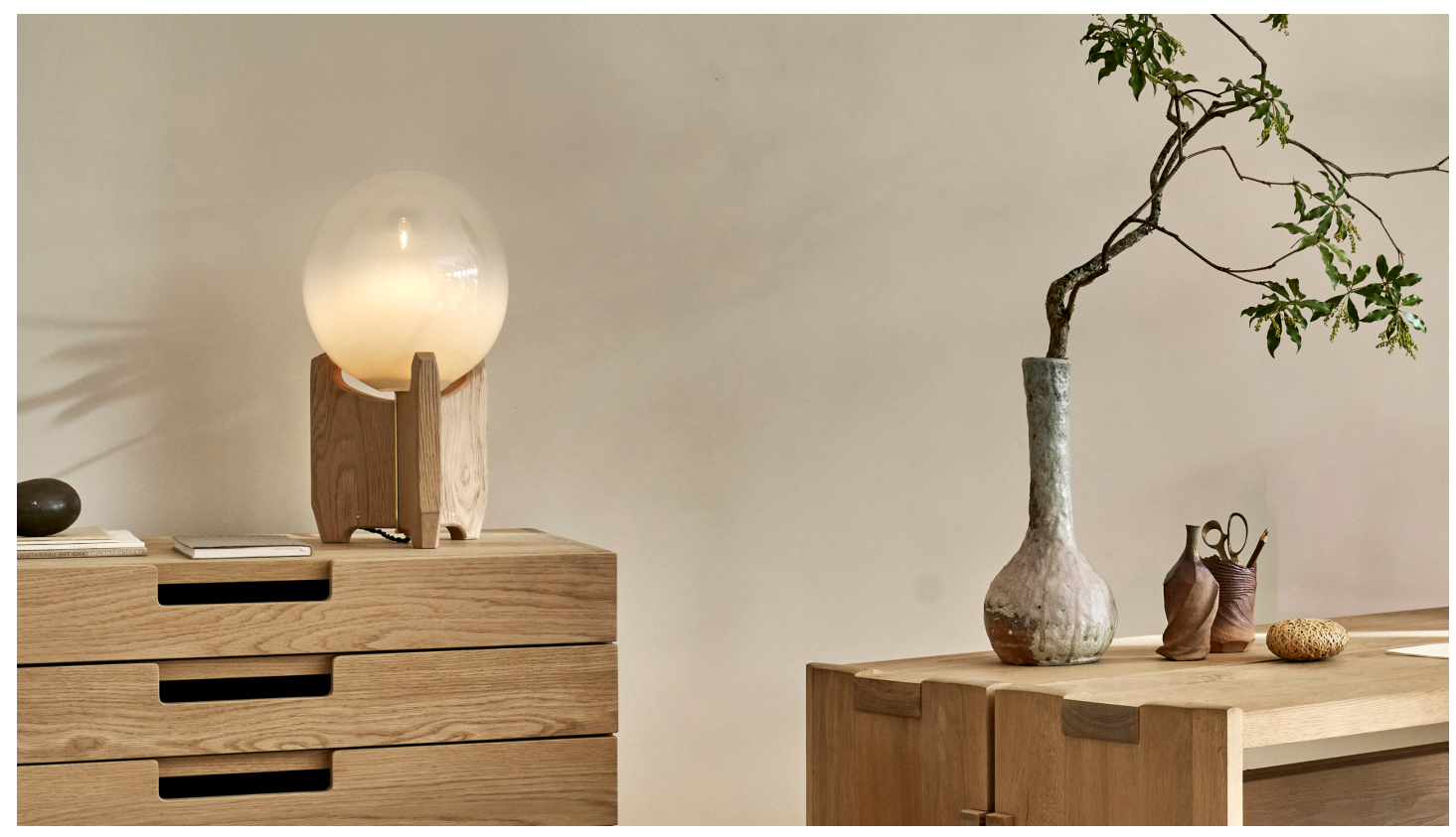
BURNISHED BRASS, OLD GROWTH WHITE OAKED SOAPED, GRADIENT GLASS SHADE