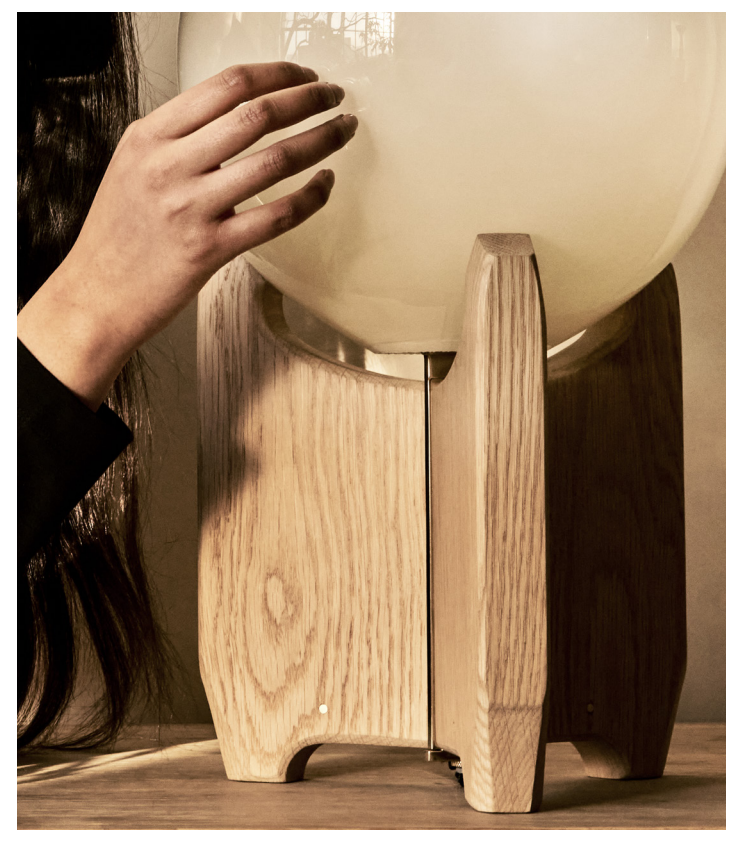
BURNISHED BRASS, OLD GROWTH WHITE OAKED SOAPED, GRADIENT GLASS SHADE