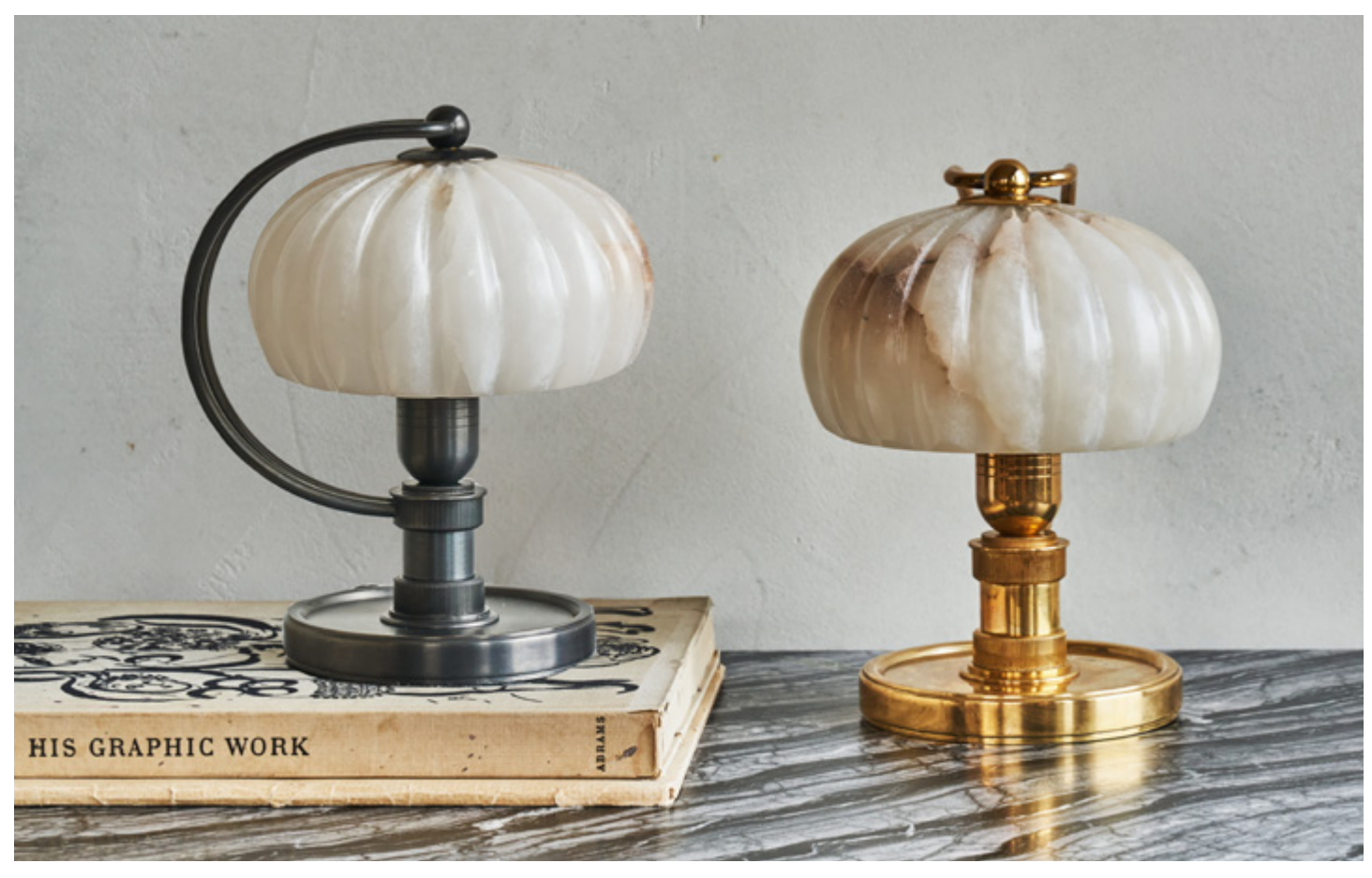
THE DAHLIA IN BLACKENED BRASS (LEFT) AND BURNISHED BRASS (RIGHT).