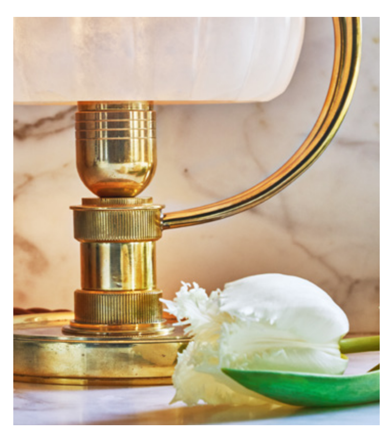
THE DAHLIA IN BURNISHED BRASS, ALABASTER SHADE

In the unrivaled opulence and otherworldly glow of alabaster, the Dahlia Table Lamp transfigures the world's finest stone into a graceful flowerhead, weighing heavy on its stem-like arm.