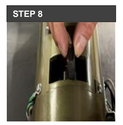
Insert motor brush into brush holder. With twist tie still attached to motor brush spring, insert spring back into the holder. Once secured, remove the twist tie.

The tip should be concaved, shiny & smooth. If pit marks, deep vertical scratches, dull or uneven wear, chips, cracks, broken brush present itself, replace the motor brushes.