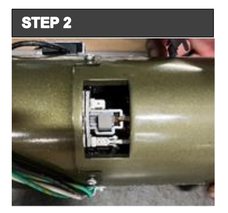
The motor brush spring and motor brushes will be exposed.