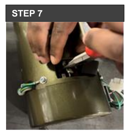
Using needle nose pliers, reattach the motor brush wire to the terminal that you originally removed it from. (See Step 3 for reference)