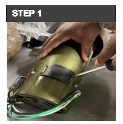
Remove the motor brush cap with a flat head screwdriver.