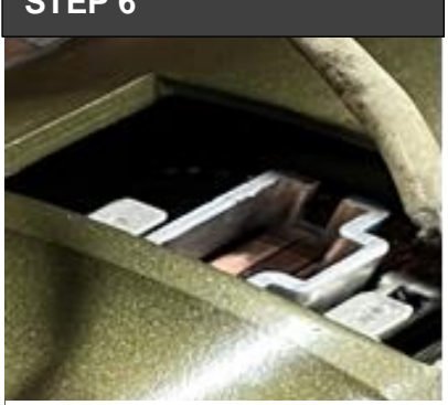
Refer to Commutator Inspection & Maintenance below for detailed steps.