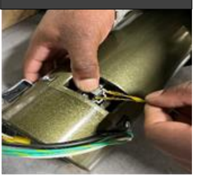
Wrap a twist tie around the Brush Spring. Holding the twist tie press down and forward on the metal spring. Slide the motor brush spring out. Remove the motor brush from the brush holder.