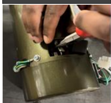
Using needle nose pliers, remove the motor brush wires from the connector.