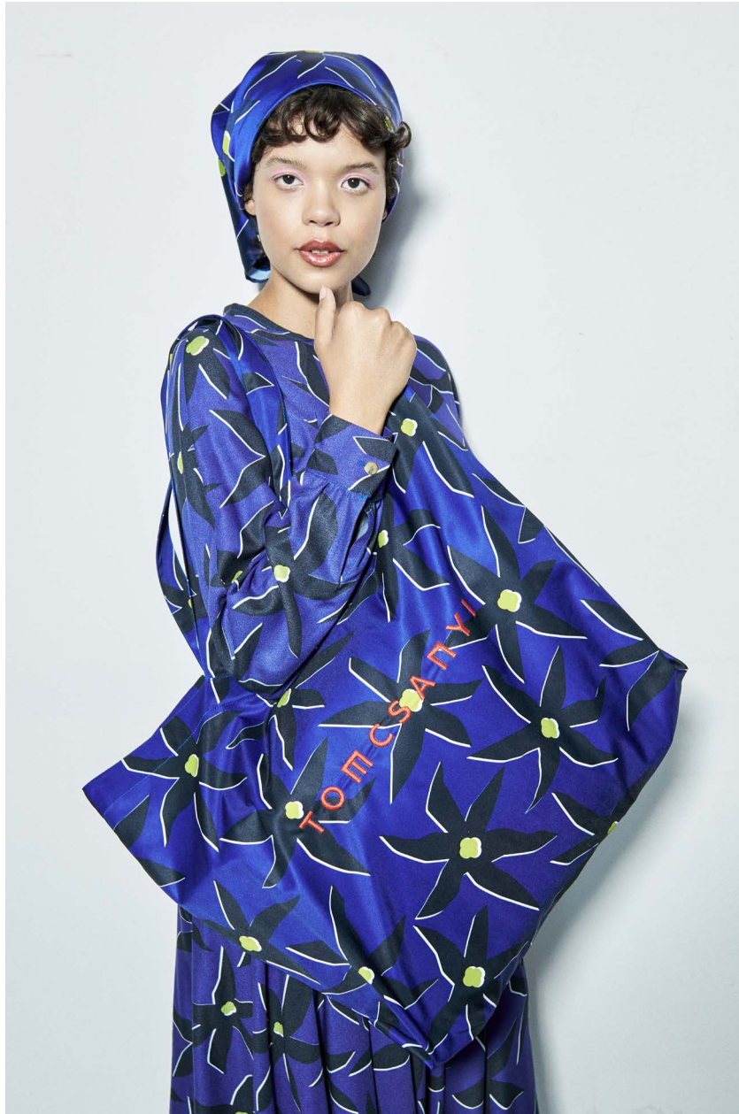
NEFELEJCS asymmetric dress GUDAURI tote bag