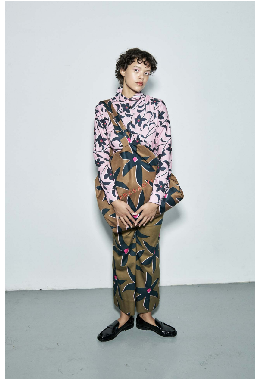
CSIPKE fitted shirt SZEGFU flared canvas trousers GUDAURI tote bag