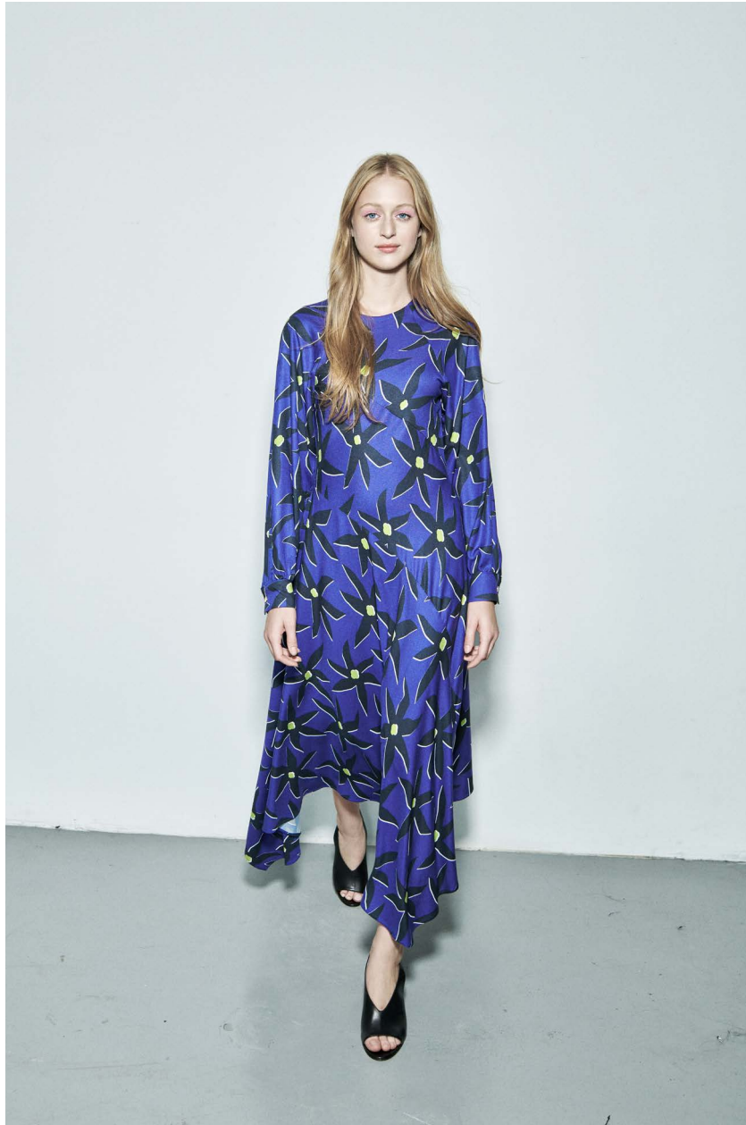
NEFELEJCS asymmetric dress