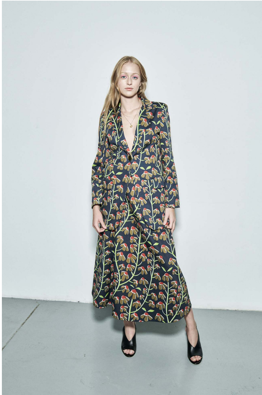
TULIPAN tailored canvas blazer KISKUN canvas midi skirt