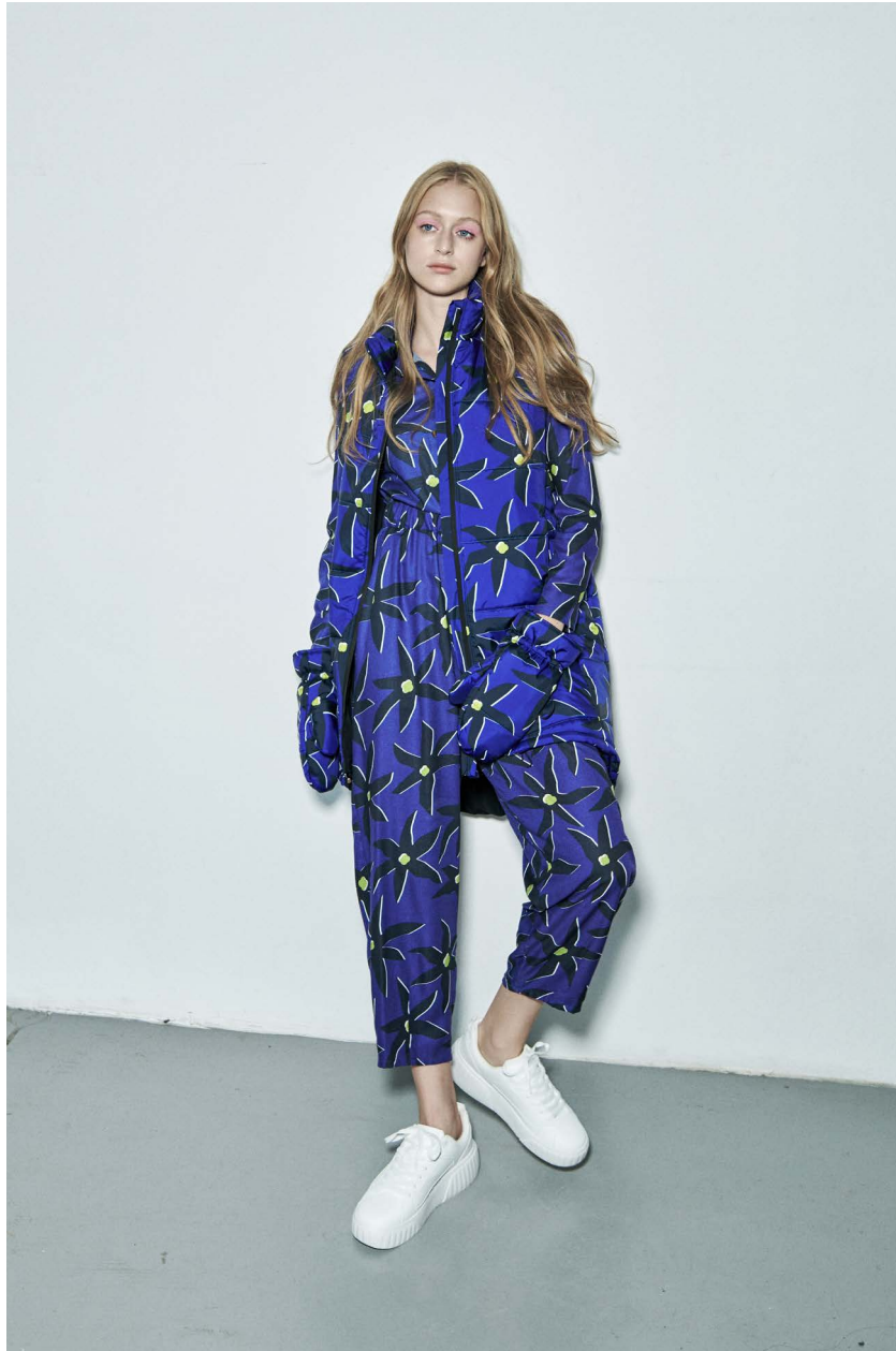
PIPACS barrel leg jumpsuit MONT BLANC long puffer vest DOLOMITES puffer mittens