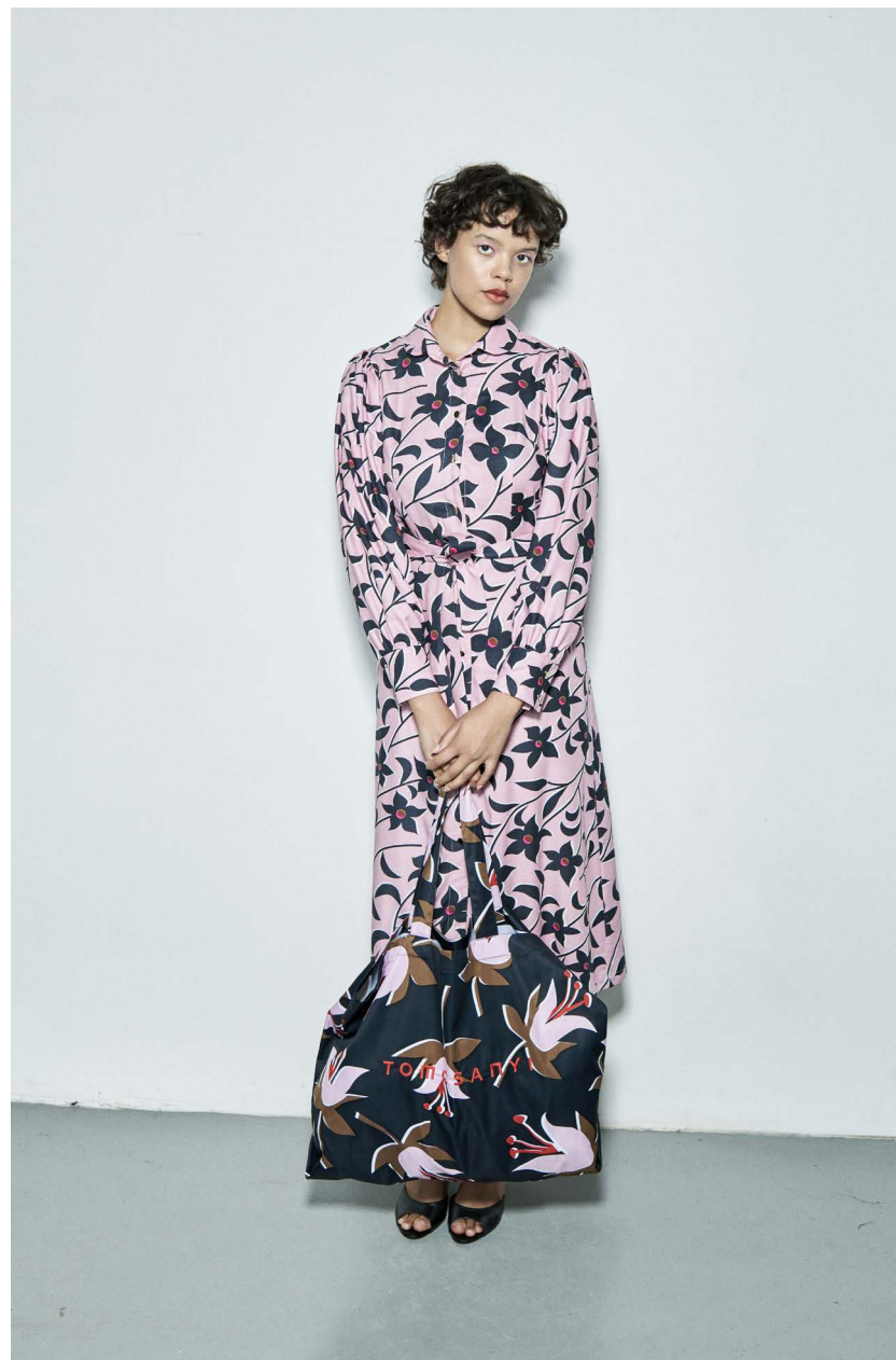
BUZA mid-length shirtdress GUDAURI tote bag