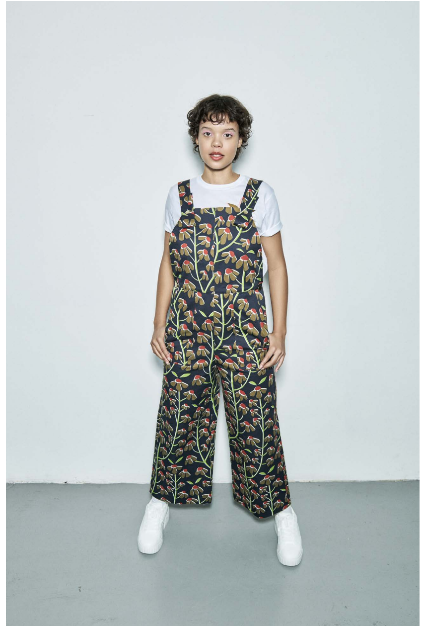
STARFLOWER T-shirt ORGONA canvas dungarees