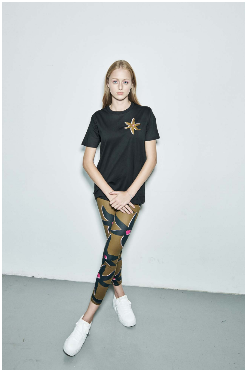
STARFLOWER T-shirt JASNA jersey leggings