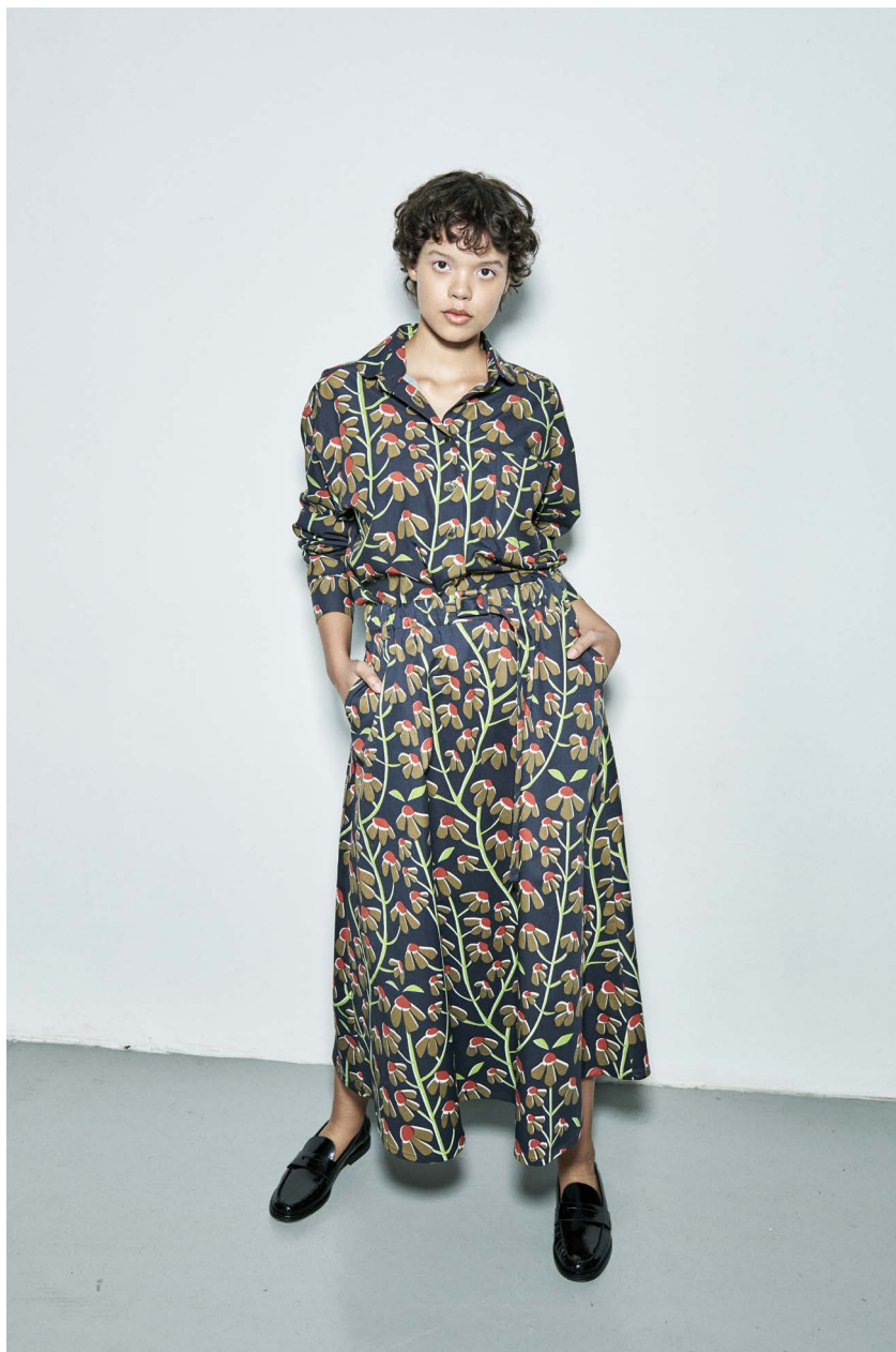
CSILLAG oversized poplin shirt KISKUN canvas midi skirt