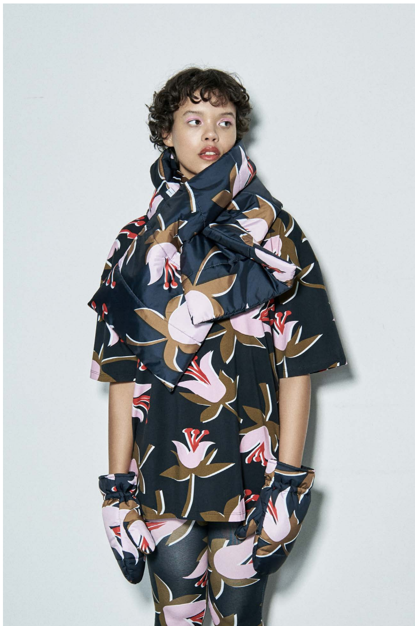
KITZBÜHEL puffer scarf VIZITKE oversized T-shirt DOLOMITES puffer mittens JASNA jersey leggings