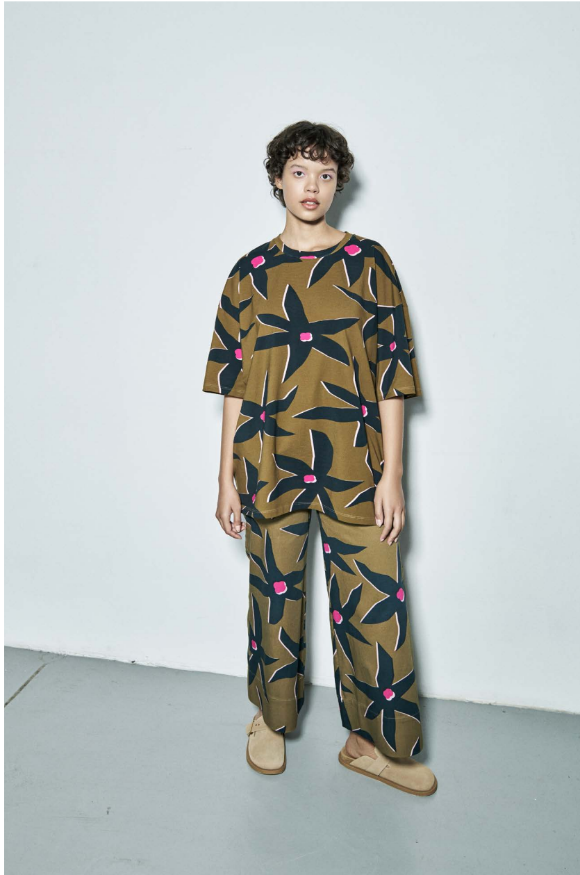
VIZITKE oversized T-shirt SZEGFU flared canvas trousers