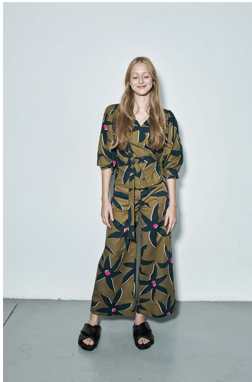
IBOLYKA poplin wrap blouse SZEGFU flared canvas trousers