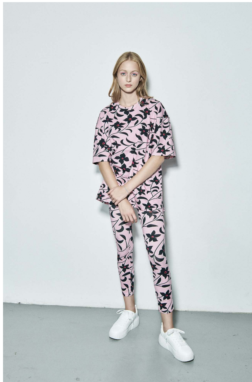
VIZITKE oversized T-shirt JASNA jersey leggings