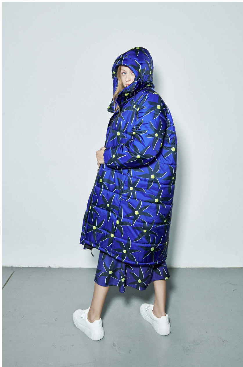
BUZA mid-length shirtdress ILUS puffer coat