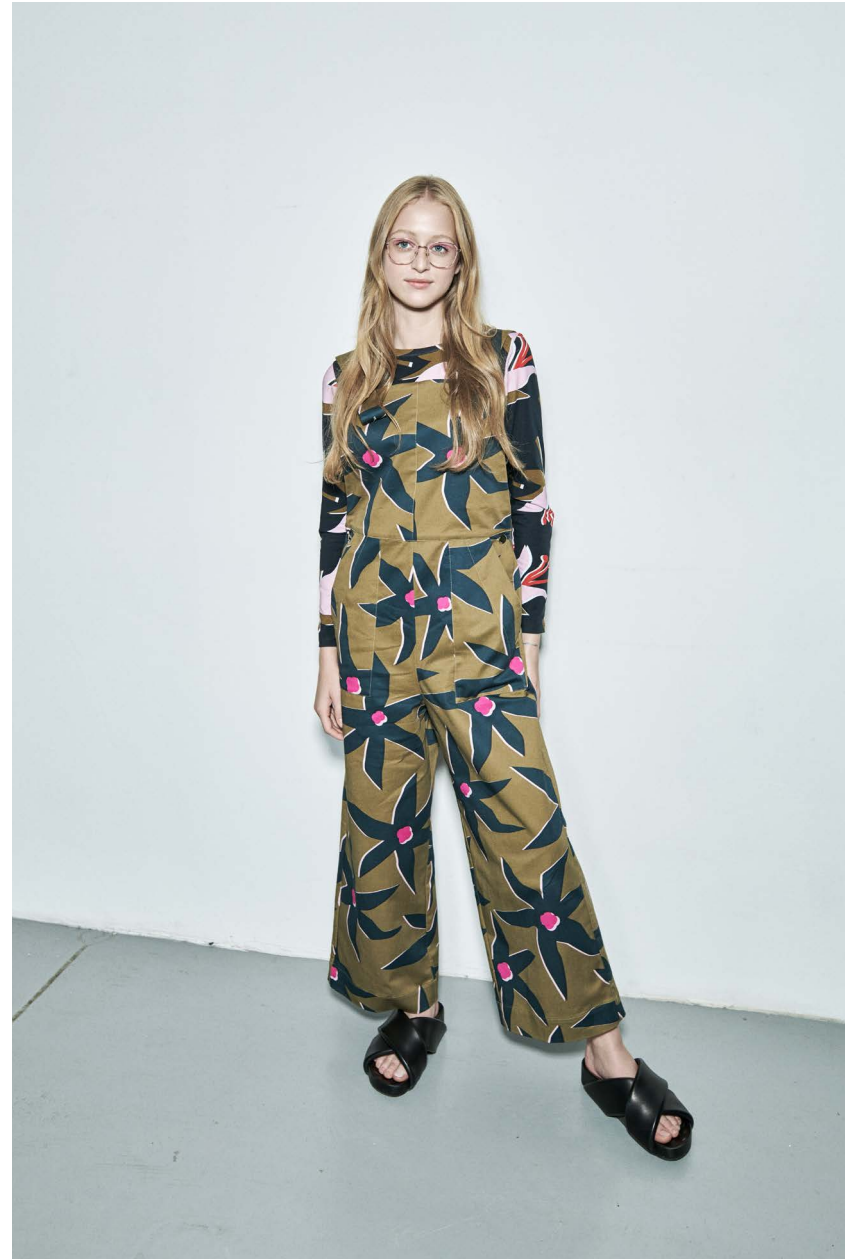
KOMA long sleeve top ORGONA canvas dungarees