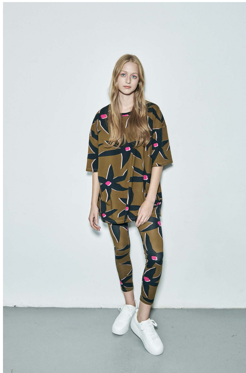
VIZITKE oversized T-shirt JASNA jersey leggings