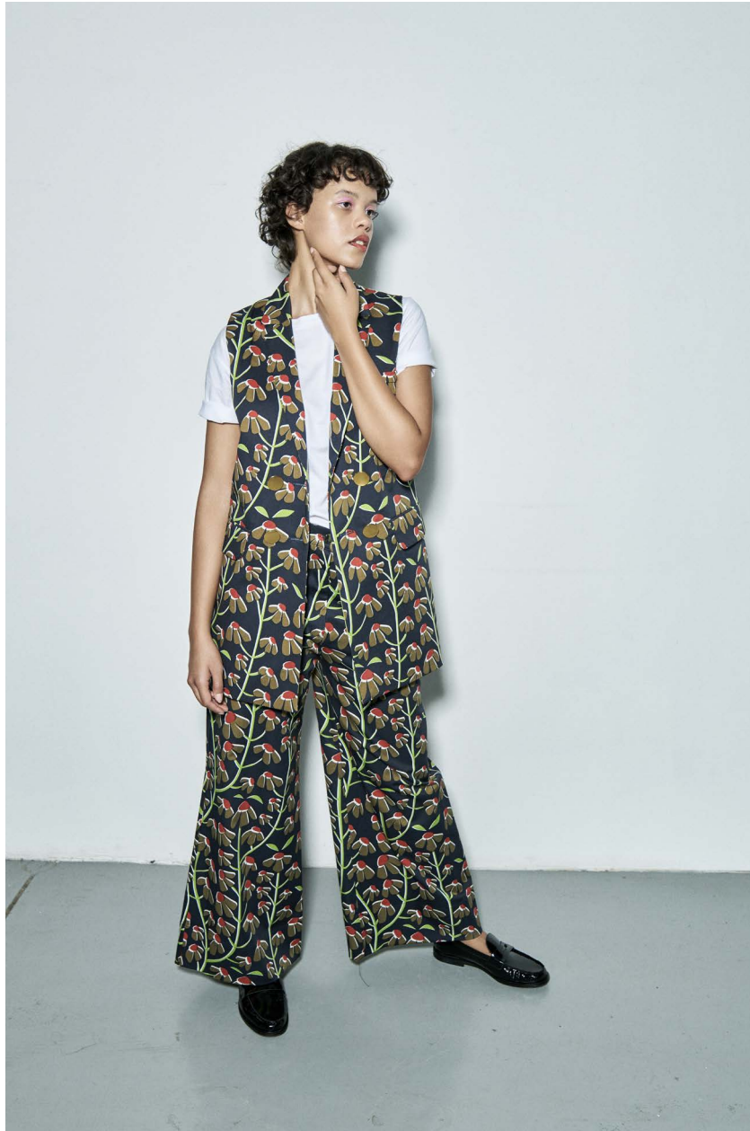
STARFLOWER T-shirt PAPRIKA tailored canvas vest SZEGFU flared canvas trousers