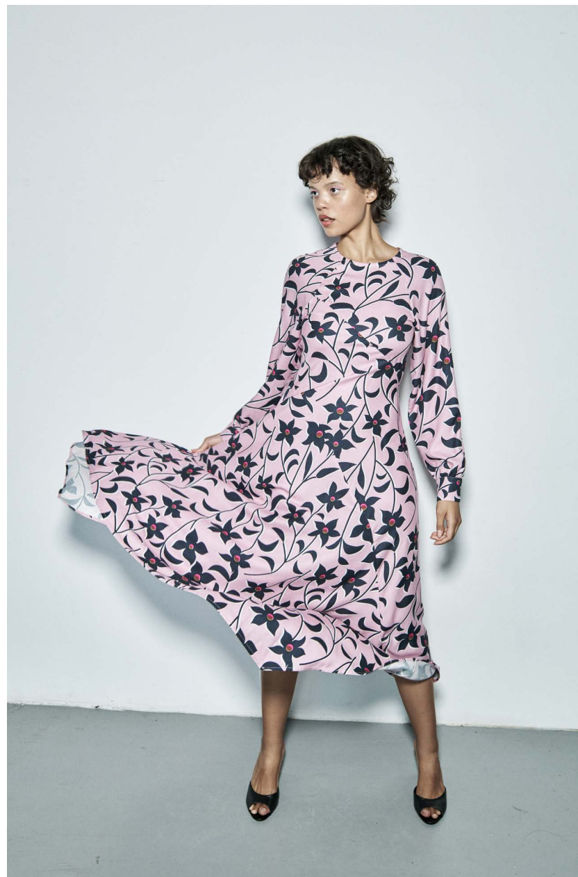
NEFELEJCS asymmetric dress