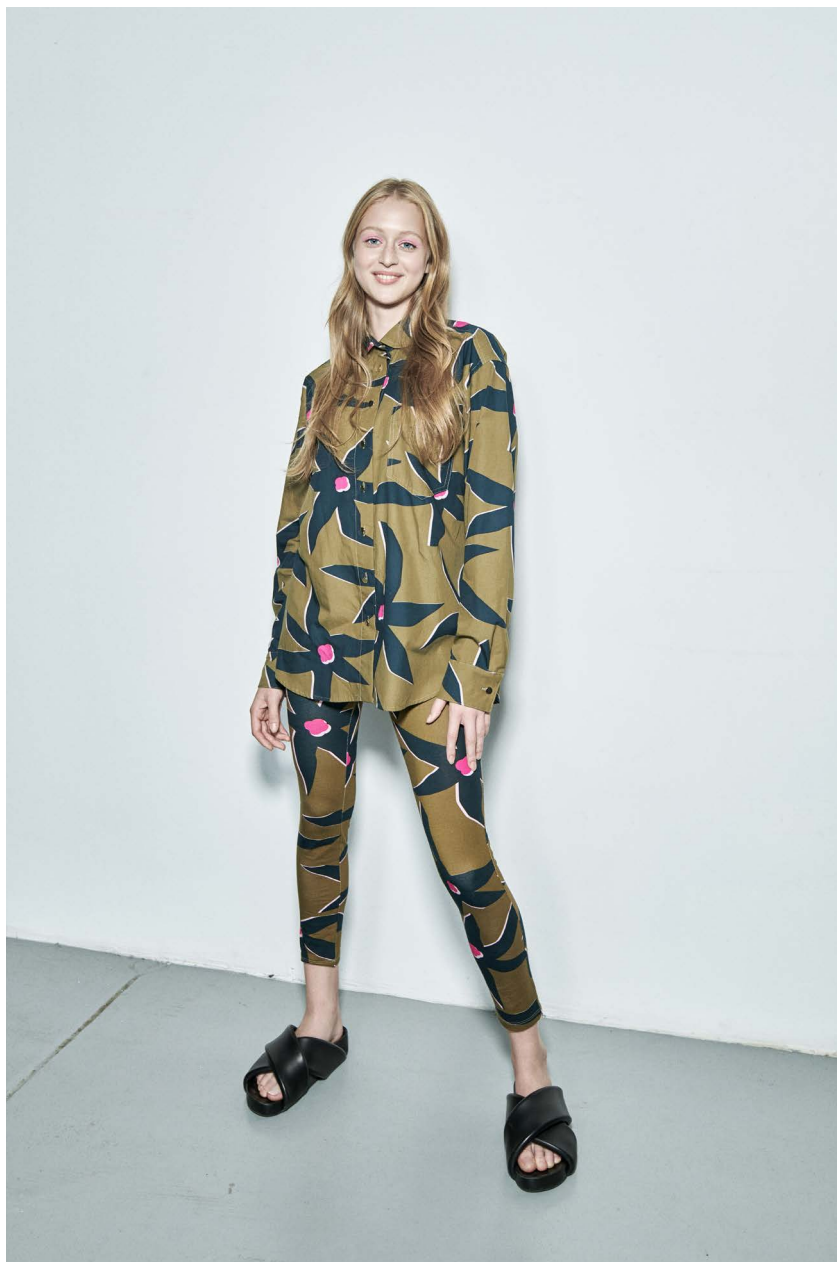
CSILLAG oversized poplin shirt JASNA jersey leggings