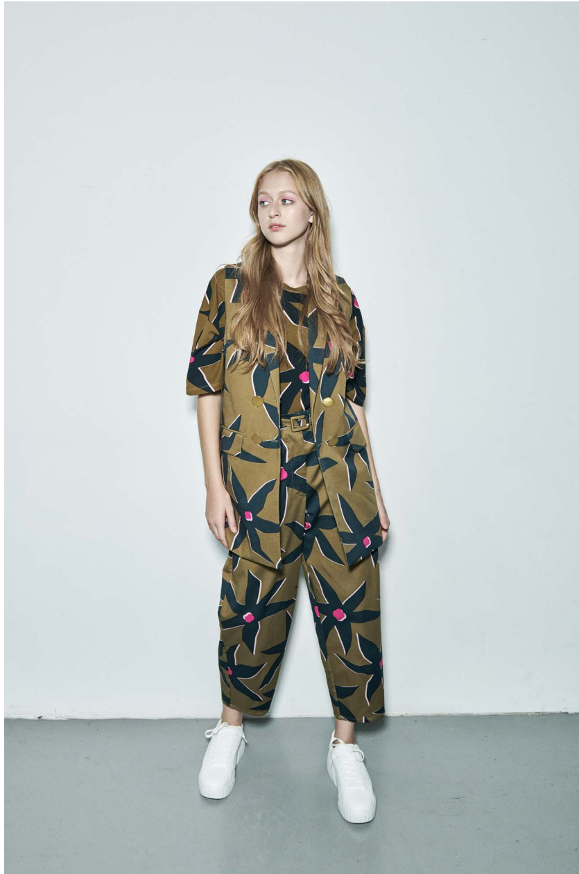
VIZITKE oversized T-shirt PAPRIKA tailored canvas vest BACS barrel leg canvas trousers