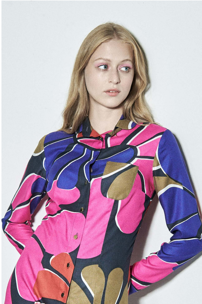
CSIPKE fitted shirt