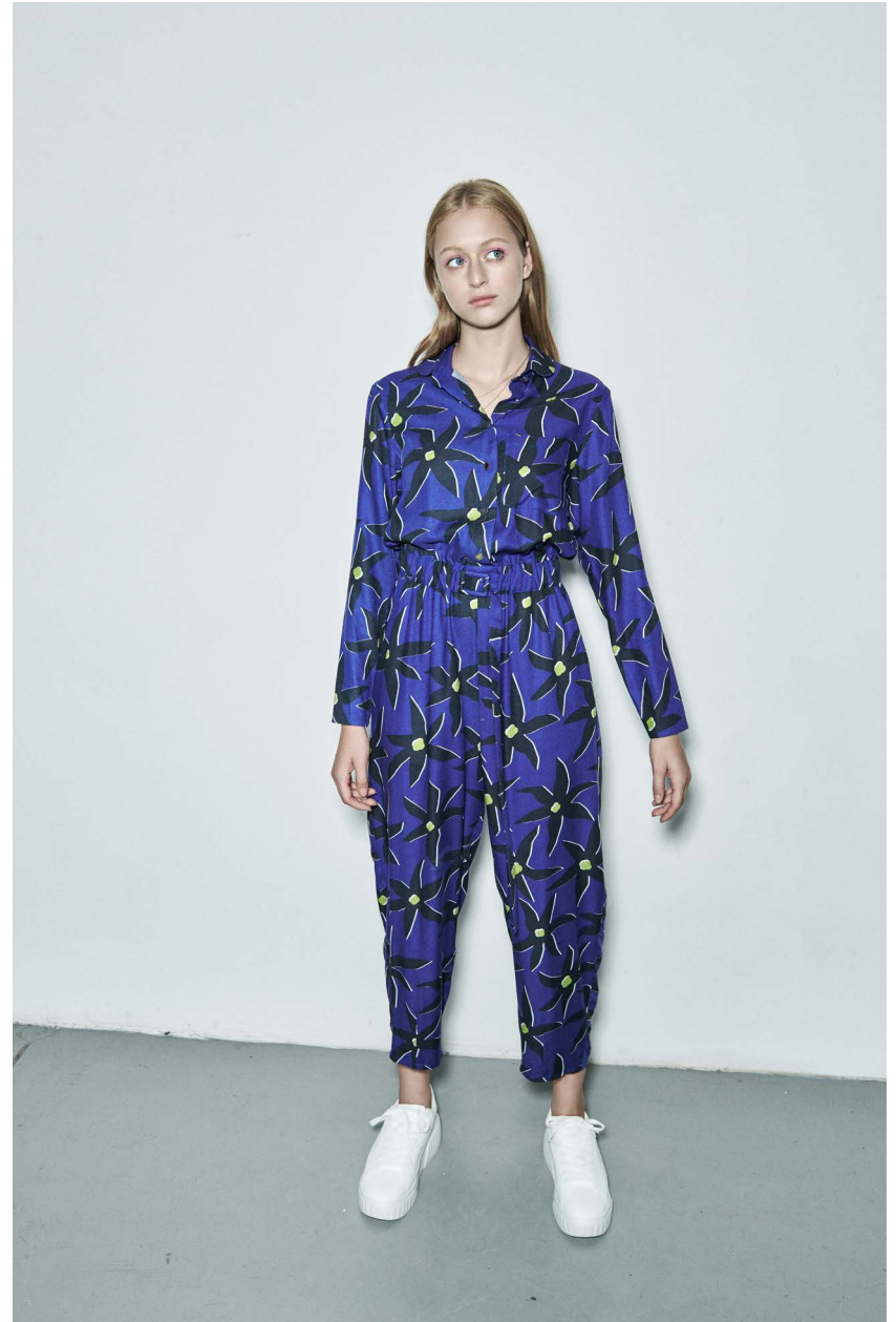
PIPACS barrel leg jumpsuit