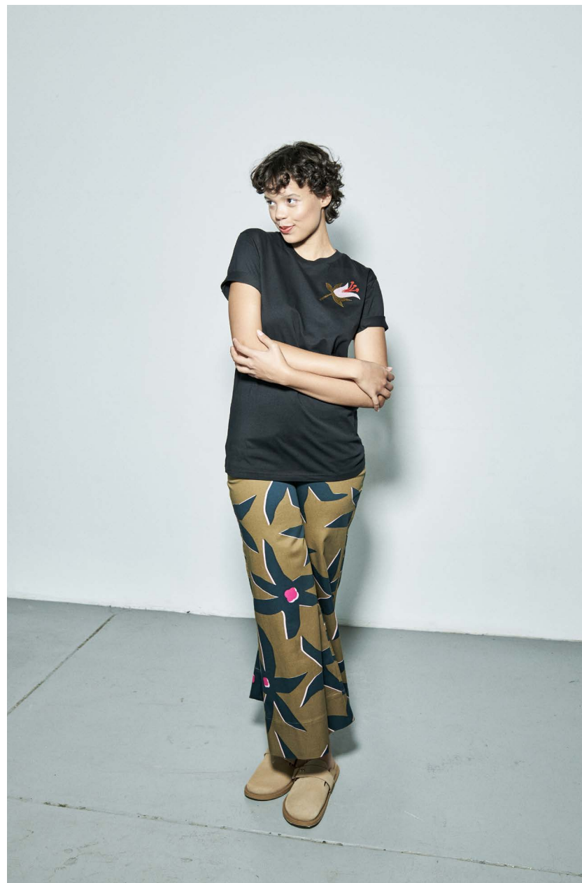
TULIP T-shirt SZEGFU flared canvas trousers