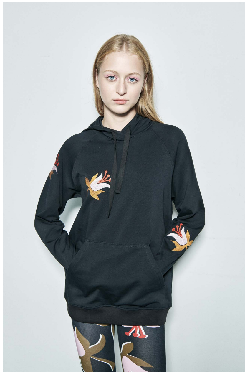
KEKES embroidered sweatshirt JASNA jersey leggings