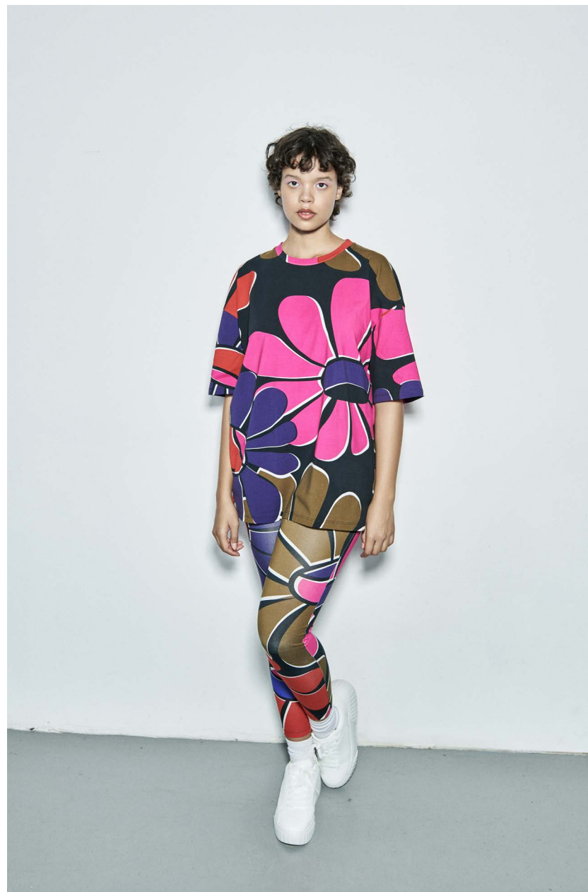
VIZITKE oversized T-shirt JASNA jersey leggings