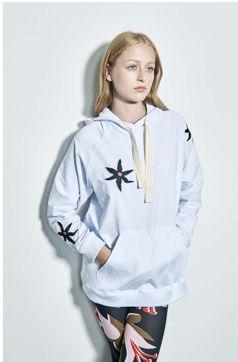
KEKES embroidered sweatshirt JASNA jersey leggings