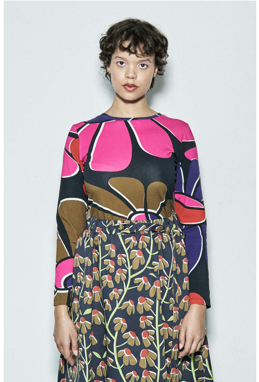
KOMA long sleeve top KISKUN canvas midi skirt