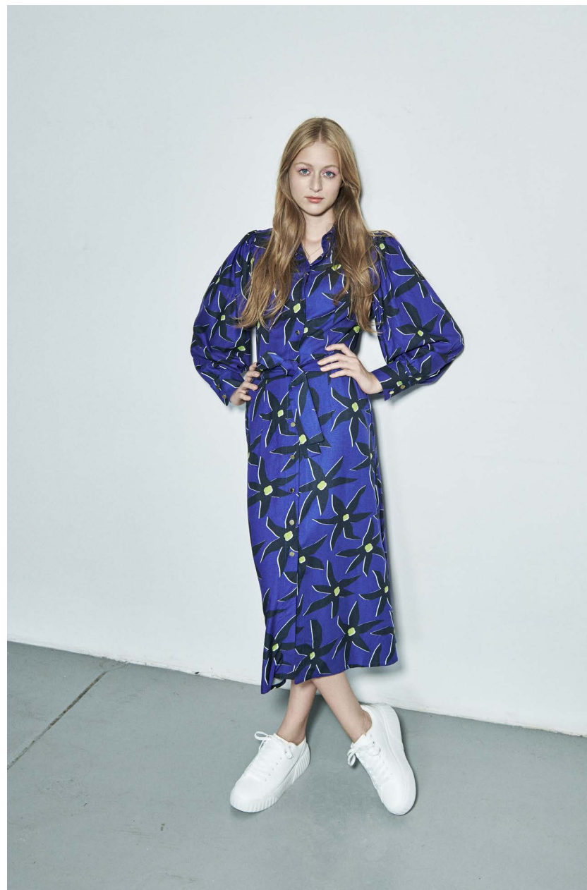
BUZA mid-length shirtdress