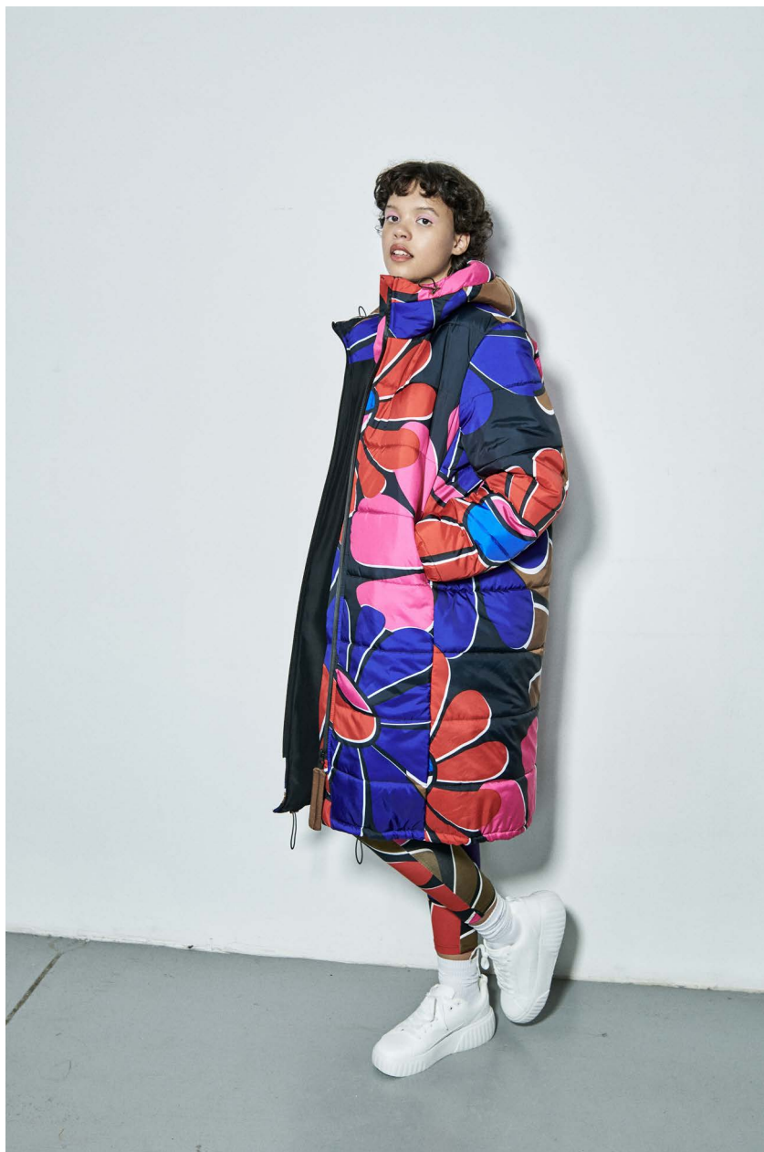
ILUS puffer coat JASNA jersey leggings