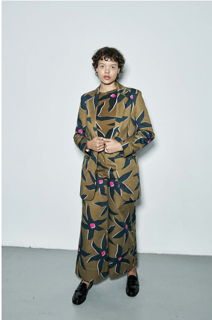
KOMA long sleeve top TULIPAN tailored canvas blazer SZEGFU flared canvas trousers