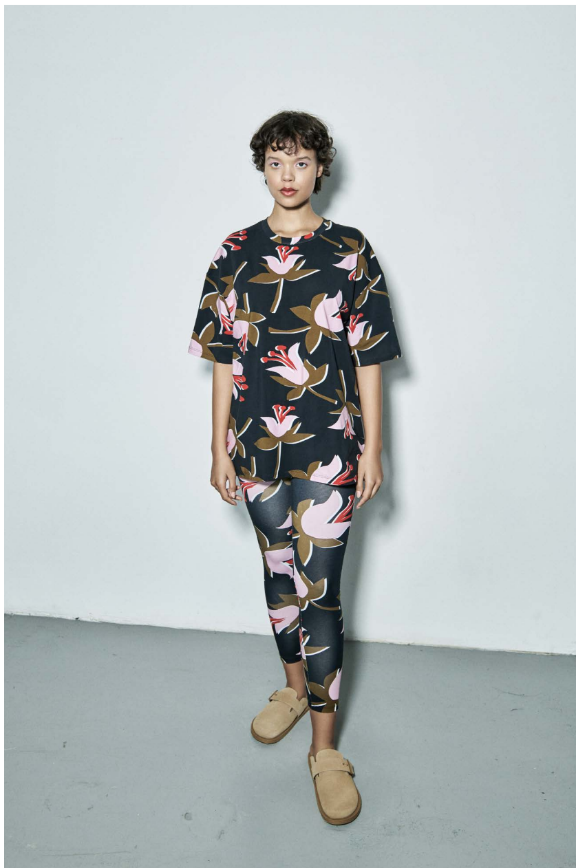
VIZITKE oversized T-shirt JASNA jersey leggings