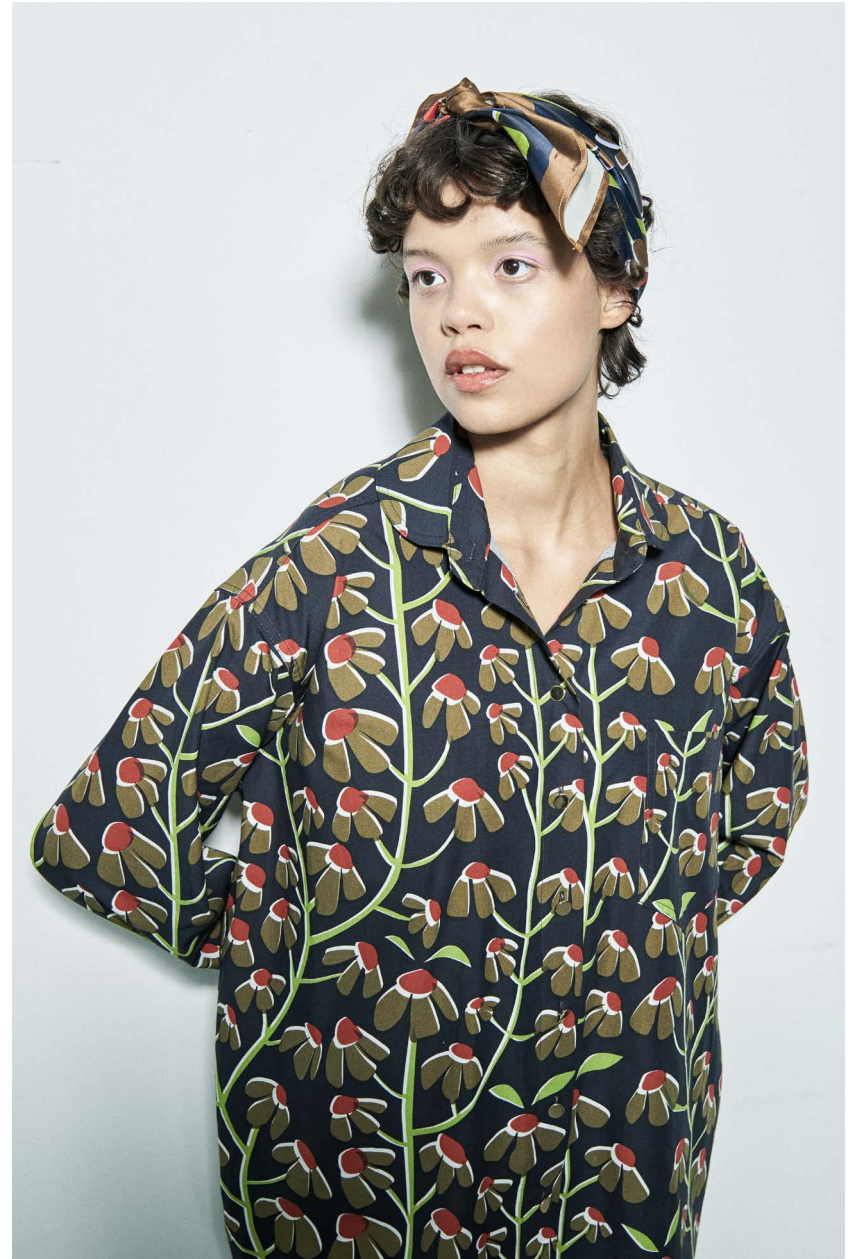
CSILLAG oversized poplin shirt