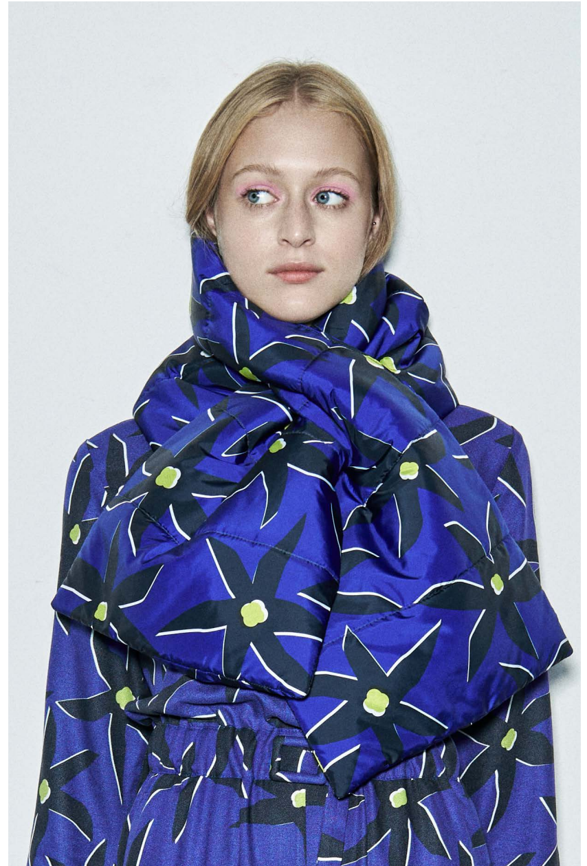
KITZBÜHEL puffer scarf PIPACS barrel leg jumpsuits