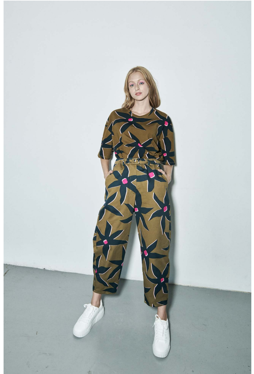
VIZITKE oversized T-shirt BACS barrel leg canvas trousers