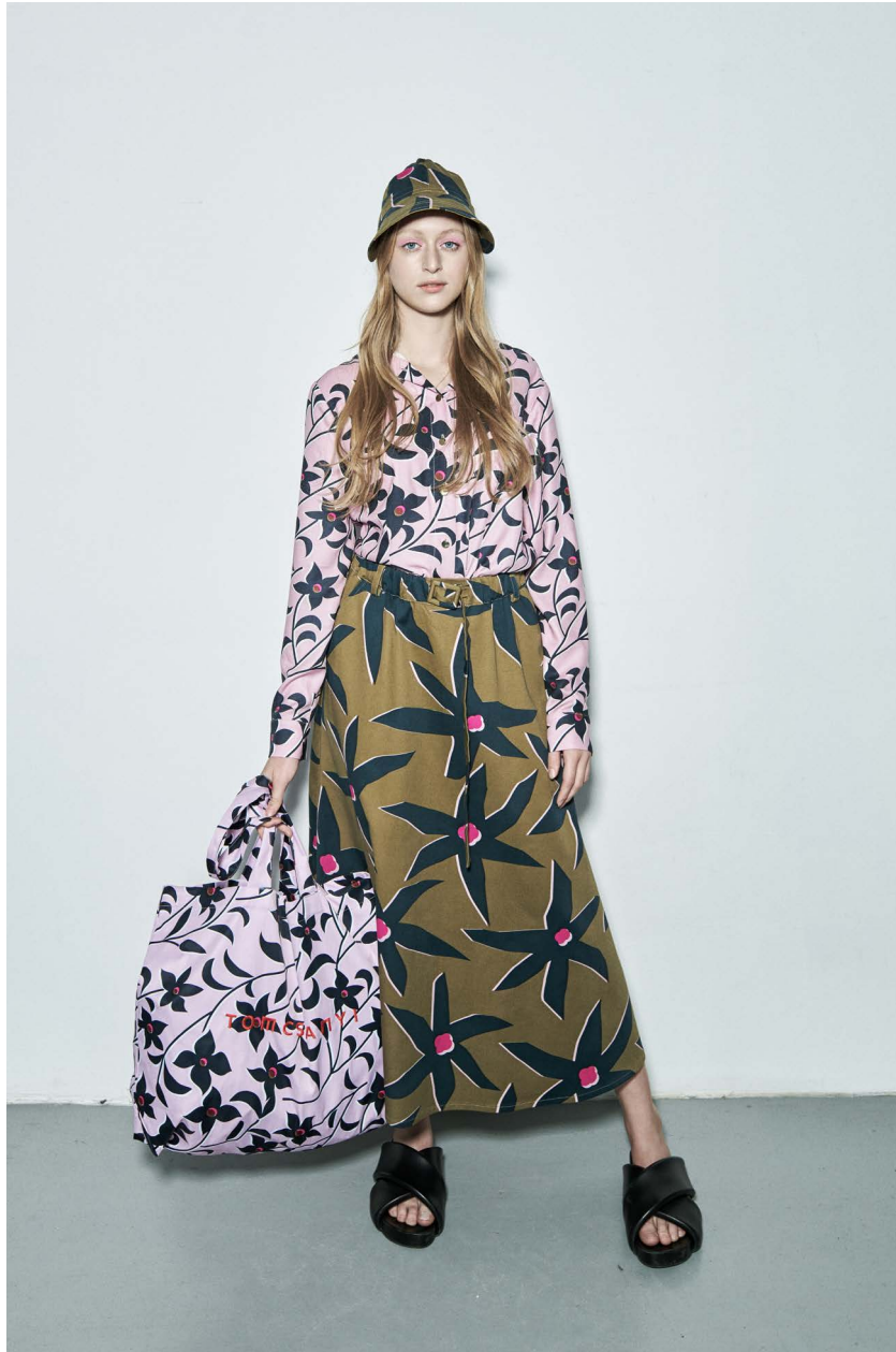
ROZMARING cap CSIPKE fitted shirt KISKUN canvas midi skirt GUDAURI tote bag