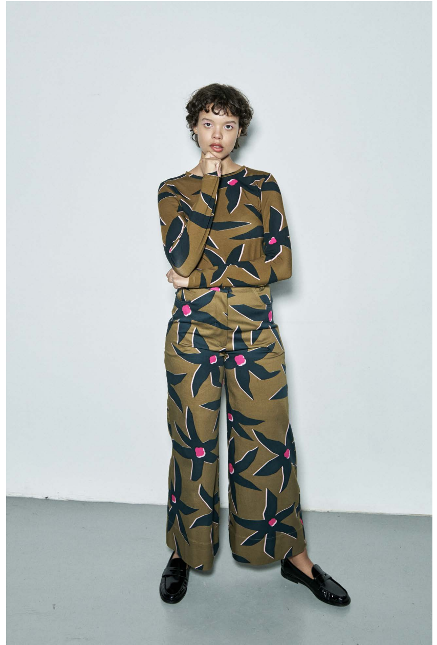
KOMA long sleeve top SZEGFU flared canvas trousers