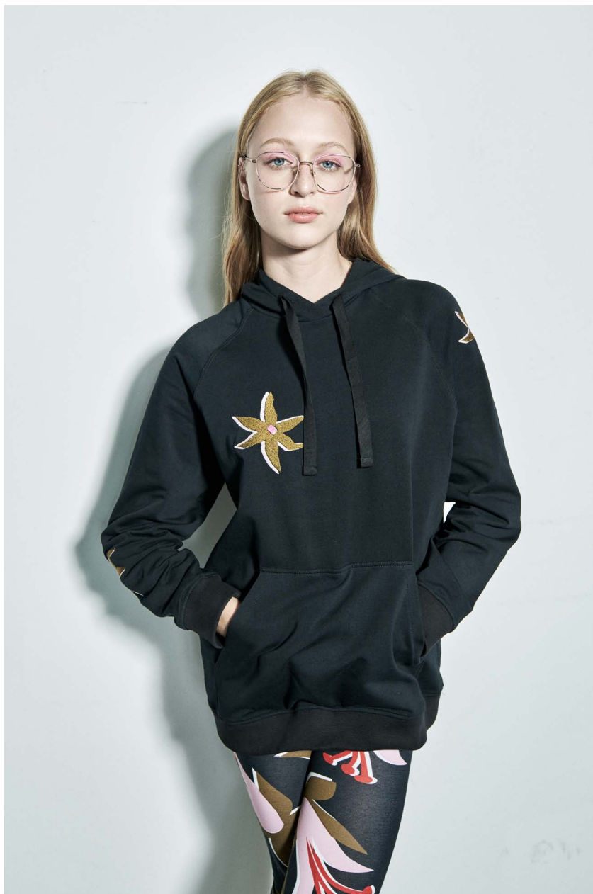
KEKES embroidered sweatshirt JASNA jersey leggings