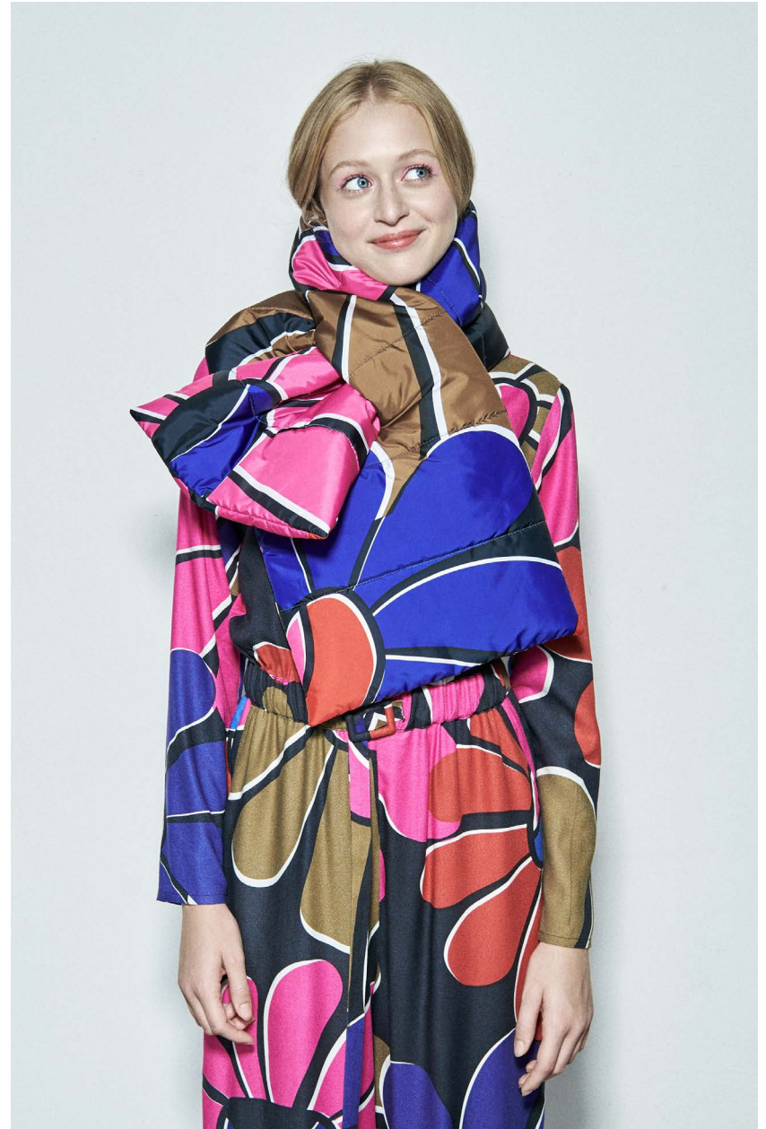
PIPACS barrel leg jumpsuit KITZBÜHEL puffer scarf