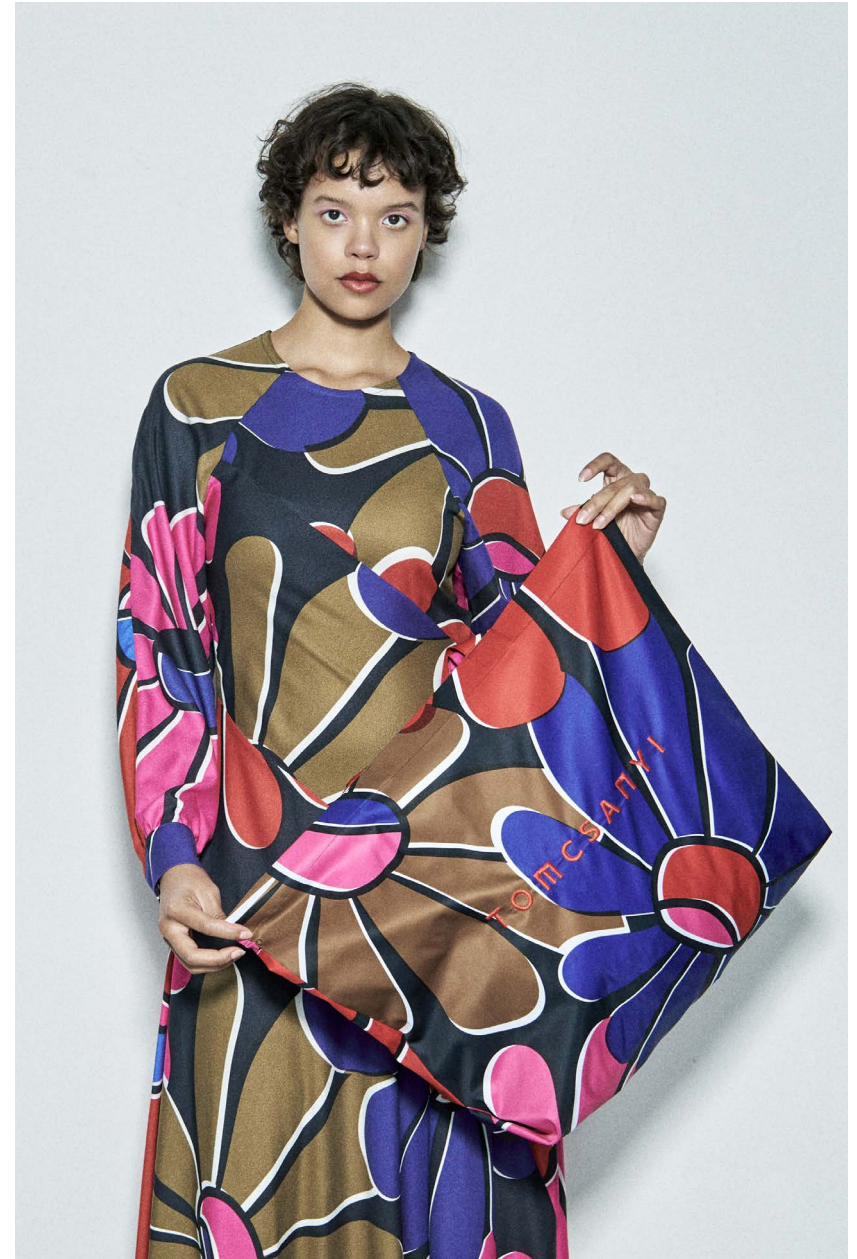
NEFELEJCS asymmetric dress GUDAURI tote bag