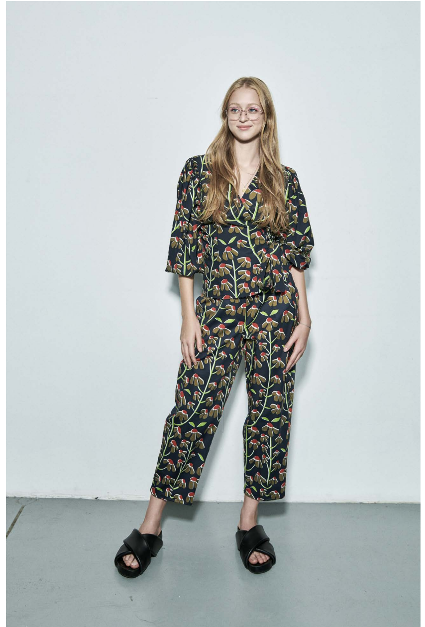
IBOLYKA poplin wrap blouse BACS barrel leg canvas trousers