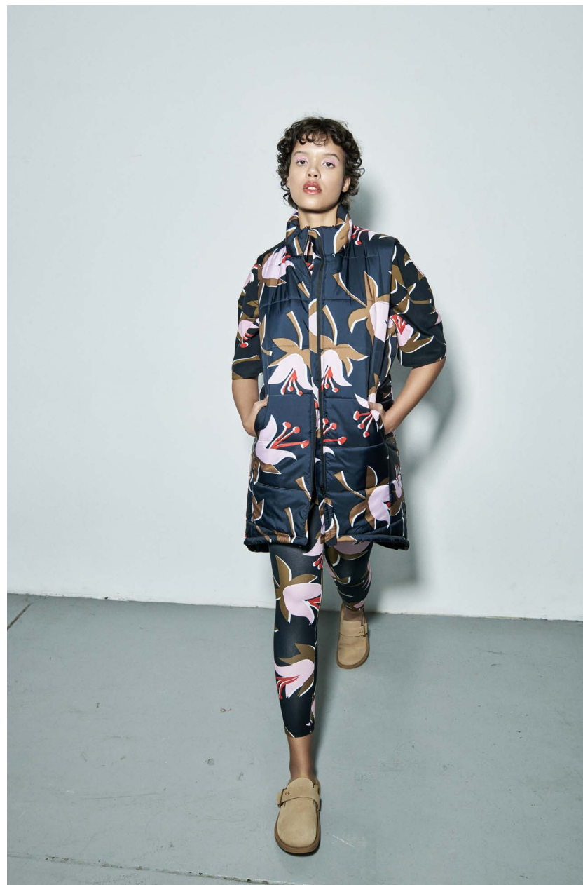
VIZITKE oversized T-shirt MONT BLANC long puffer vest JASNA jersey leggings