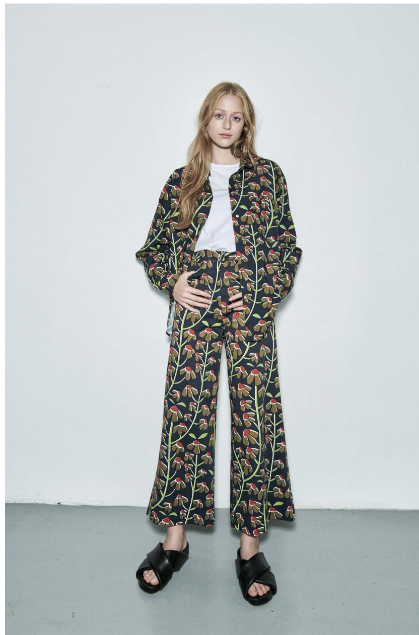
STARFLOWER T-shirt CSILLAG oversized poplin shirt SZEGFU flared canvas trousers