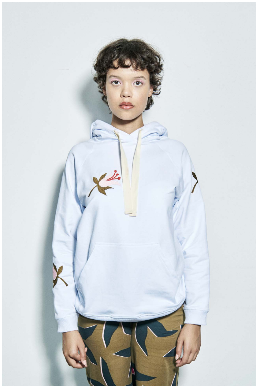
KEKES embroidered sweatshirt SZEGFU flared canvas trousers