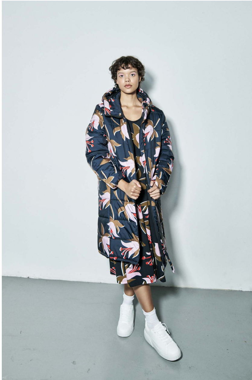
BUKOVEL scoop neck dress ILUS puffer coat