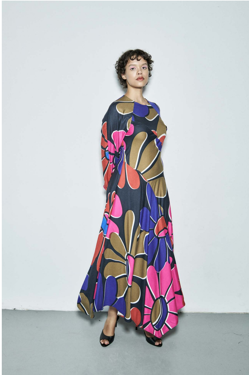
NEFELEJCS asymmetric dress