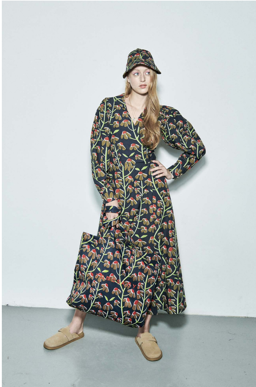
ROZMARING cap ROZSA poplin wrap dress GUDAURI tote bag