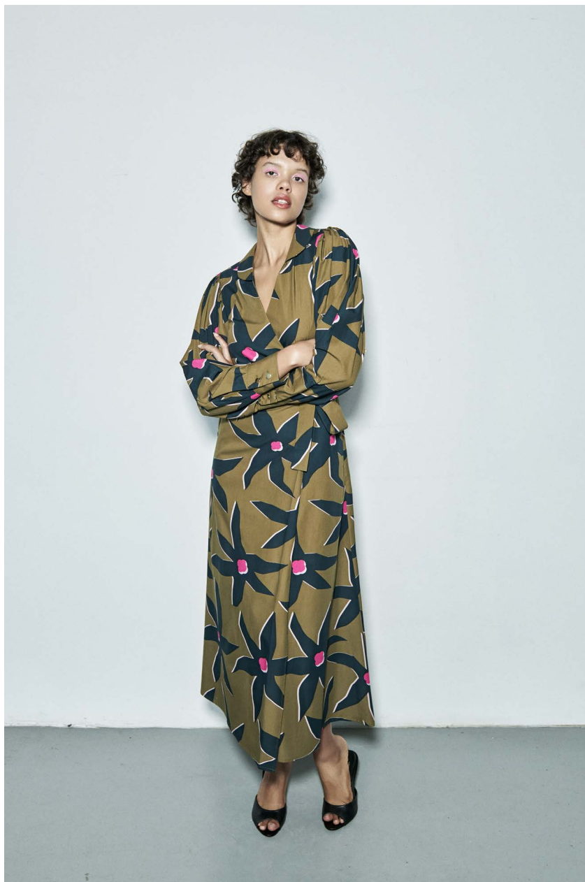
ROZSA poplin wrap dress