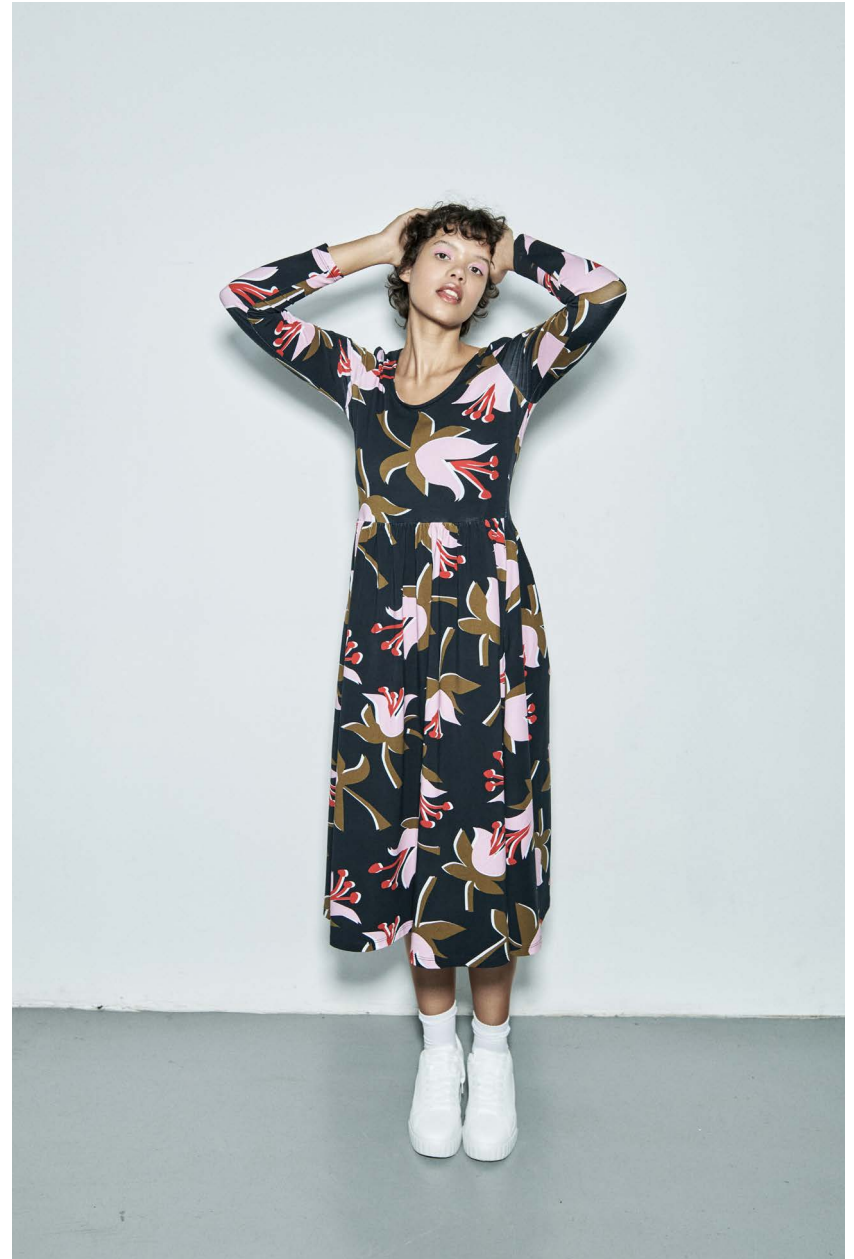
BUKOVEL scoop neck dress