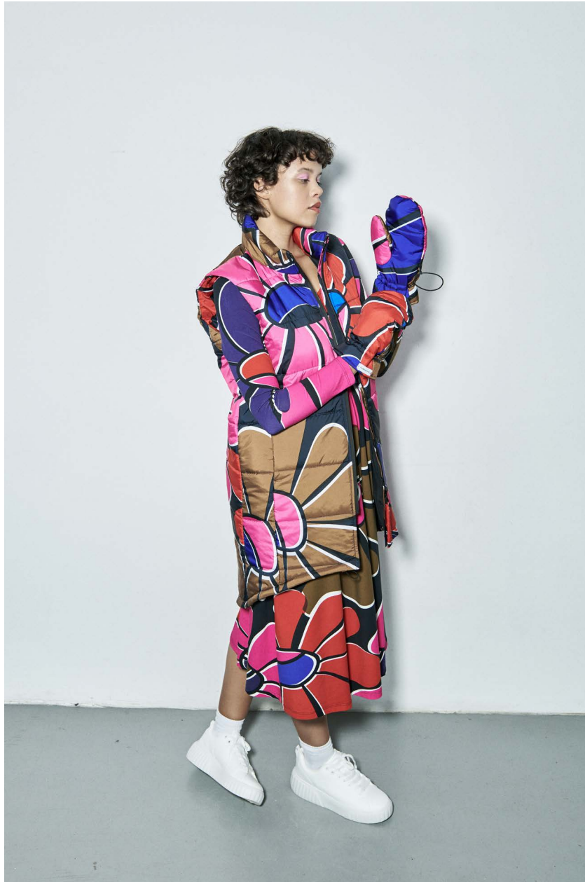
BUKOVEL scoop neck dress MONT BLANC long puffer vest DOLOMITES puffer mittens