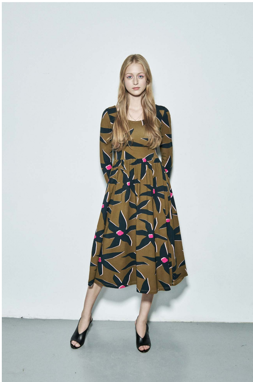
BUKOVEL scoop neck dress