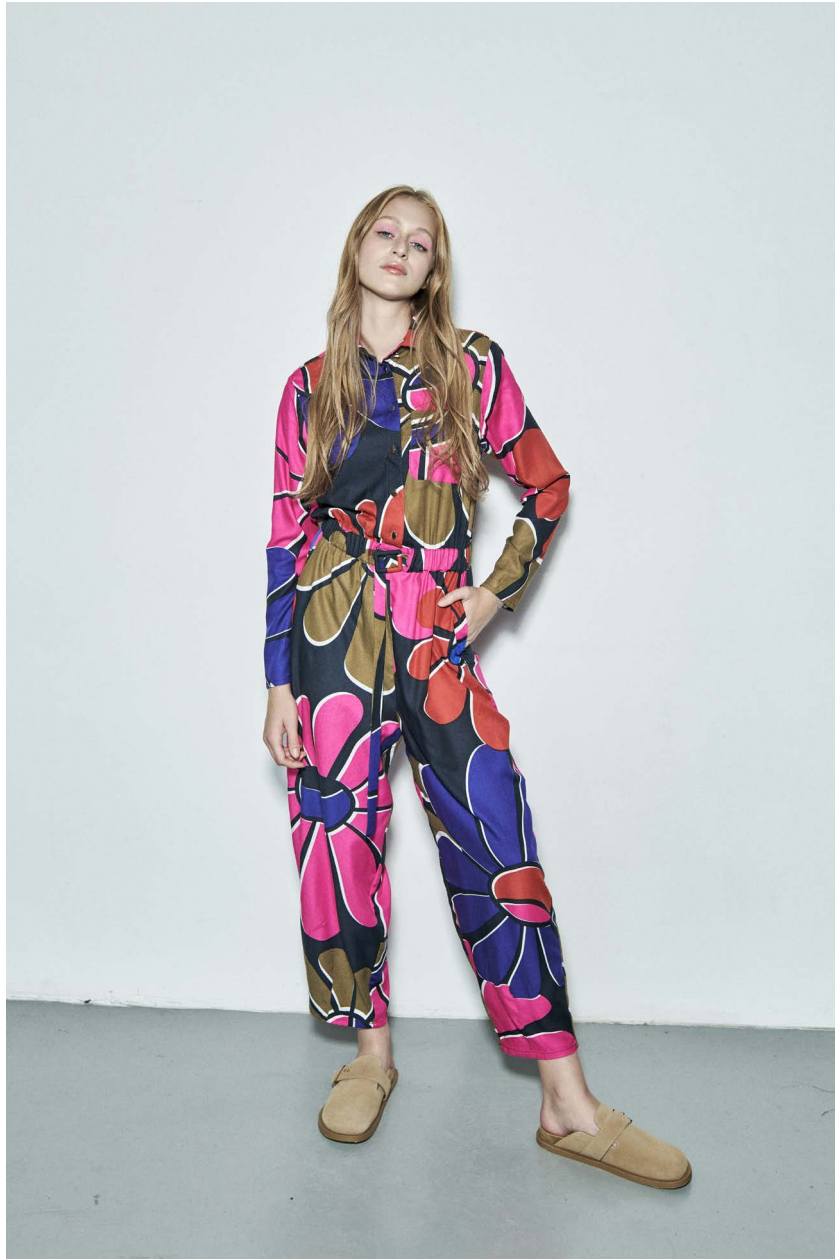
PIPACS barrel leg jumpsuit