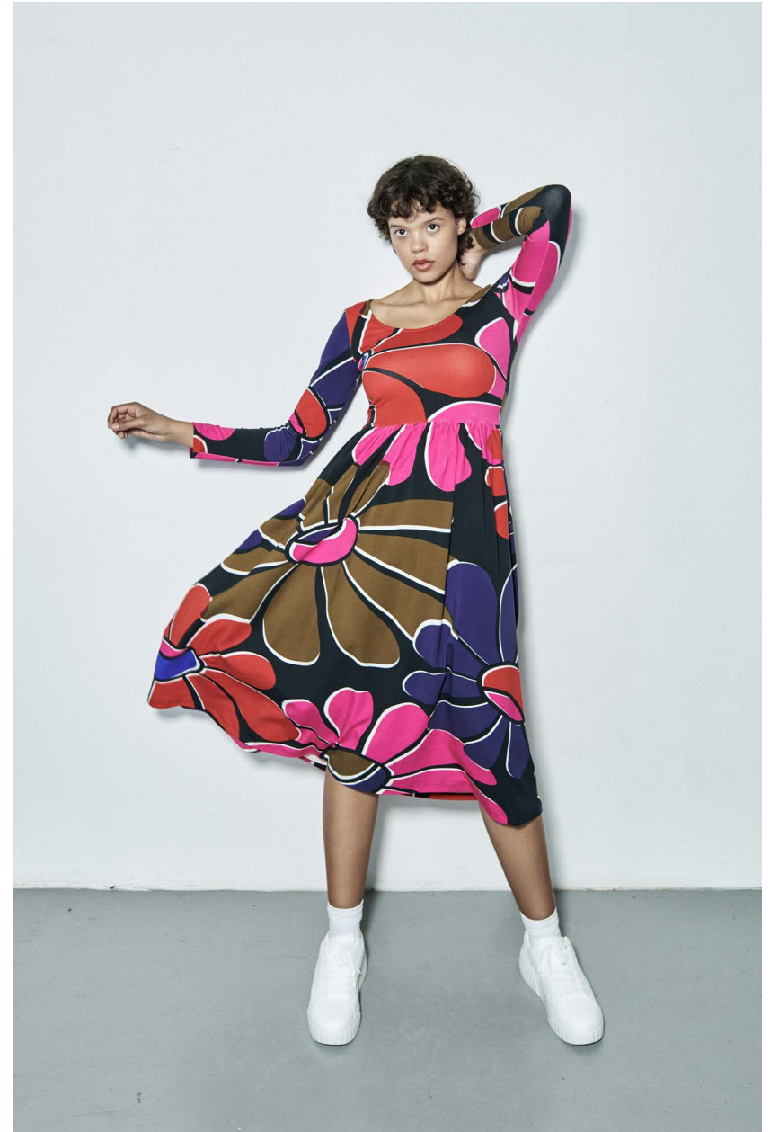
BUKOVEL scoop neck dress