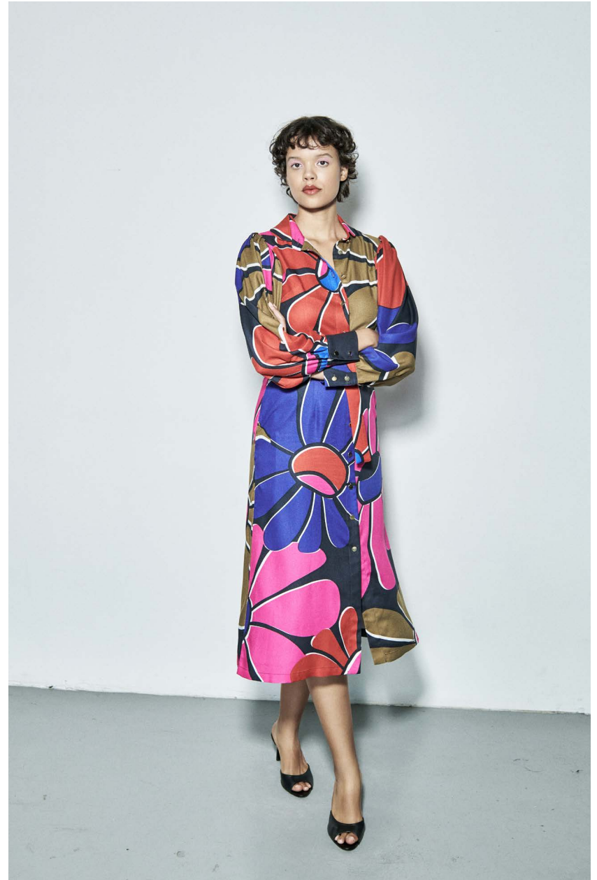
BUZA mid-length shirtdress