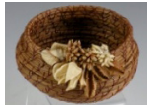
Learn how to weave Pine Needle Baskets with Kathryn Erickson

Paint outdoors from life (en plein air) along with basic art fundamentals of color temperature, value, edges, composition and paint handling. Paint "wet on wet" (alla prima) every day at a different location.